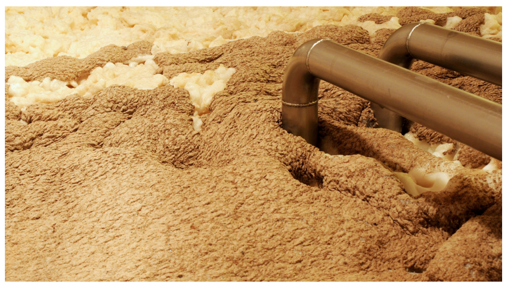
A fermenting cellar at a brewery demanding a pump to handle thick solid-laden slurry

The need for handling slurries is required in many industries. A slurry is a sloppy fluid containing some degree of pulverized solids such as organic matter, geological/metallurgical-derived or manufactured such as in foodstuffs. Slurries are often solid-laden such as malt mash in breweries, 'underflow' in mining or corrosive such as lime chemical in waste water treatment. This article examines the features and benefits of using a peristaltic pump for handling slurries.