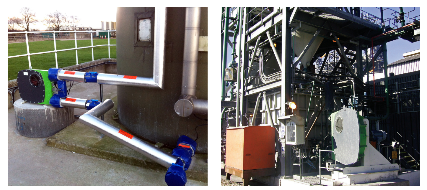
Left: A Verderflex pump circulating abrasive and corrosive lime slurry at Barston STW Right: A Verderflex handling mining slurries which are especially abrasive with metallurgical and geological particles.