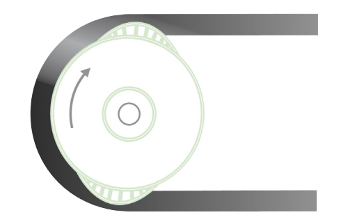
The product is drawn into the pump, travelling through the hose, contained from any moving parts

The rotor/shoe assembly revolves, compressing the flexible hose creating a 'seal' between the suction and discharge side of the pump