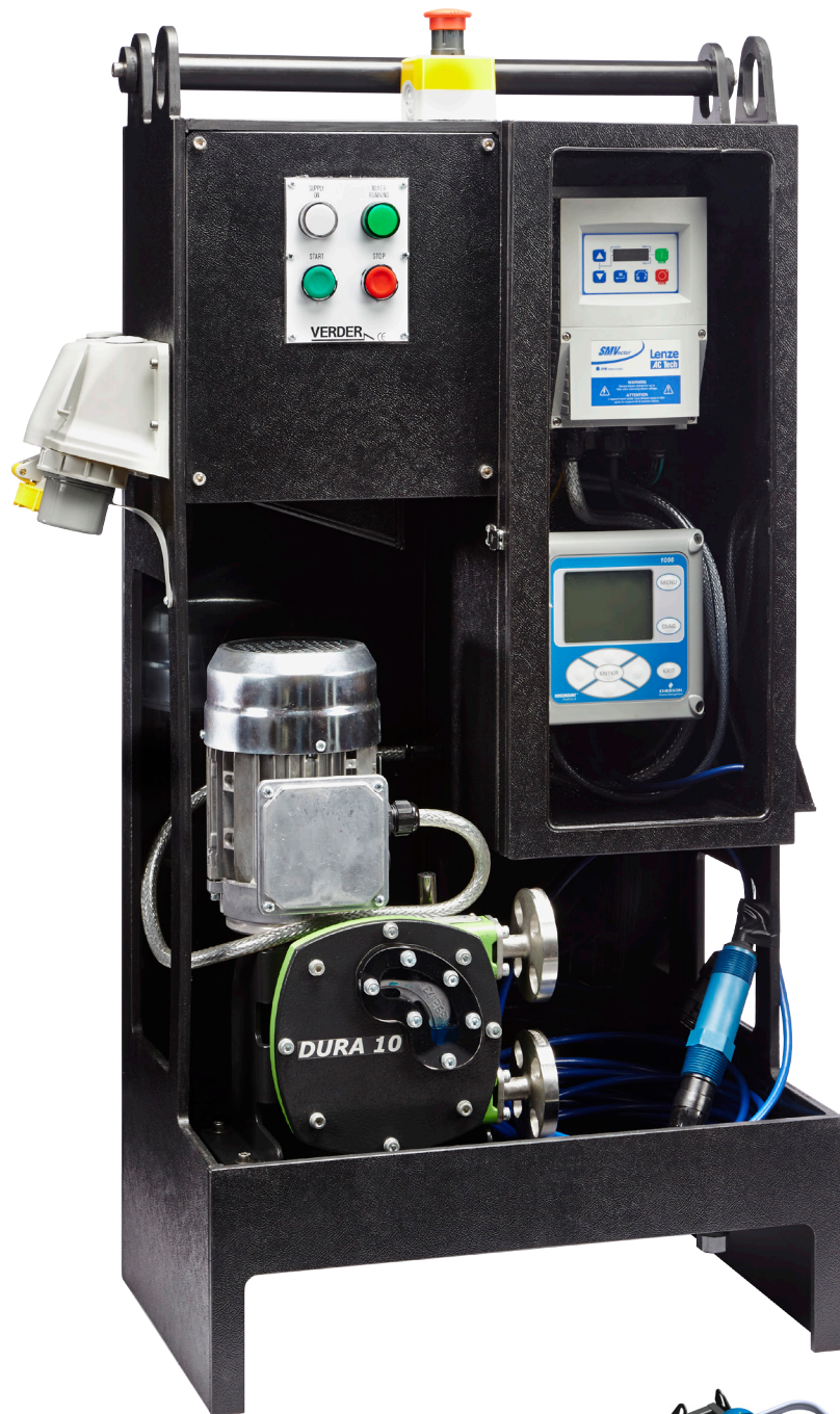
Above: The Verder dosing system - A complete packaged unit for monitoring and delivery of chemical.

The unit has been operating successfully for several months providing pH correction ensuring the water quality remains stable and suitable for the fish.