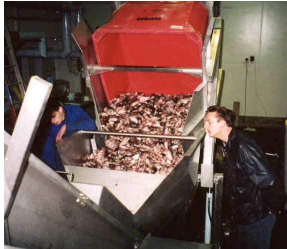
Left: A fresh batch of fish being delivered in to the processing line for filleting.

The processing plant was delighted that they could now redeploy the labourer and the process time had been reduced greatly.