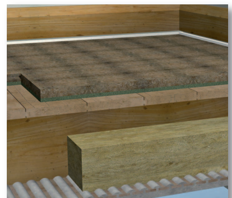
Renovo with lath & plaster ceiling