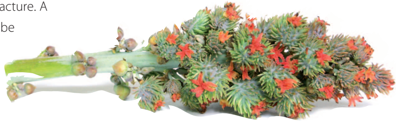
Flower of the castor oil plant ( Ricinus communis ).

Isocheck RENOVO's resilient layer (ecopoli) contains 20% renewable vegetable based components compared to zero in traditionally manufactured petroleum-based foams, with the added benefit of using less fossil fuel components in its manufacture. A completely new catalyst enables castor oil to be employed in the production of low-emission polyols. With castor oil accounting for 30% of the polyol's total weight it can contribute to yet another renewable recipe to help our environment.