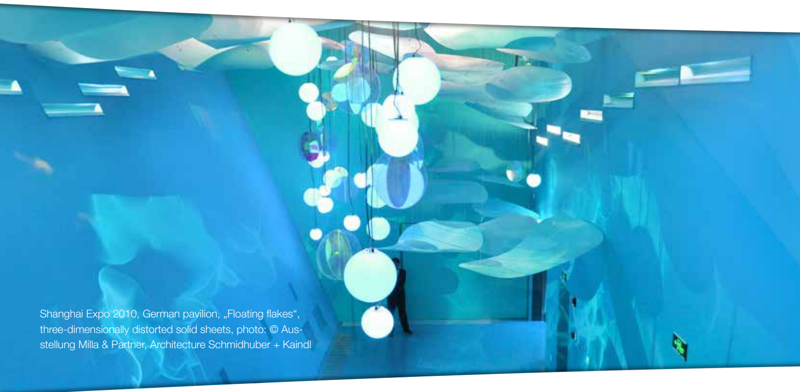
Shanghai Expo 2010, German pavilion, „Floating flakes“, three-dimensionally distorted solid sheets