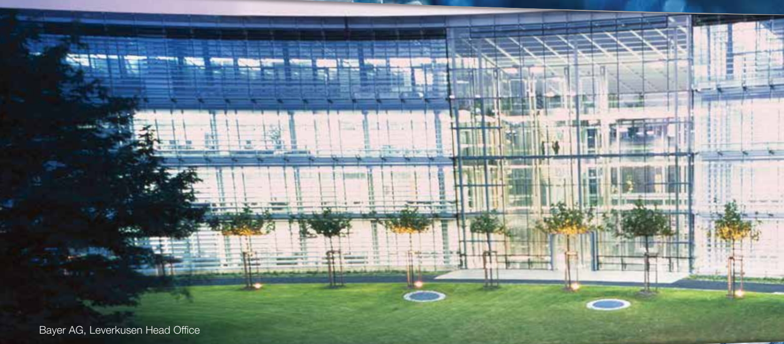
Bayer AG, Leverkusen Head Office