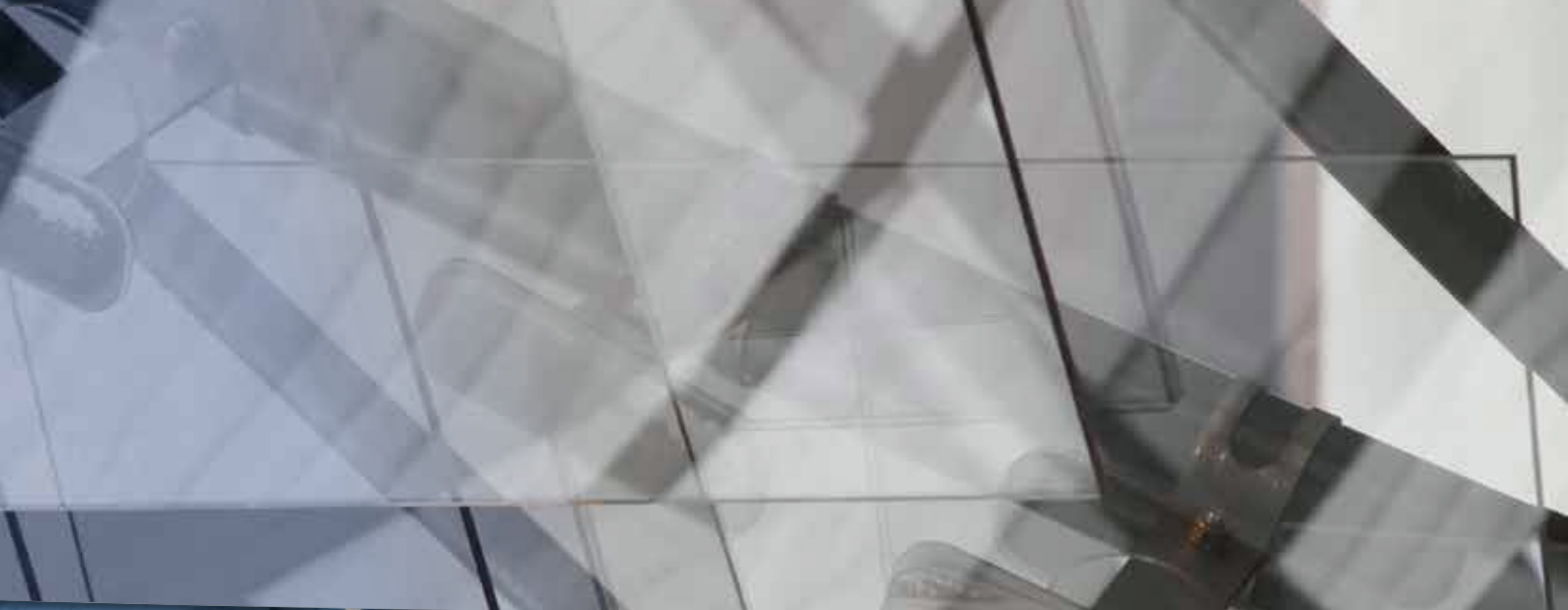
Deep-drawn Makrolon® UV solid sheet