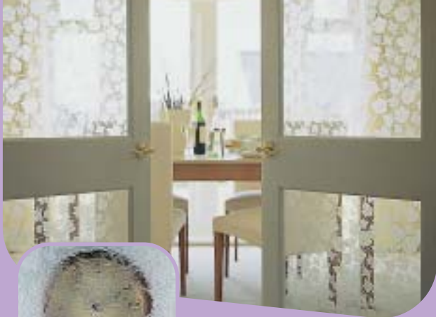
Pilkington Oriel Coppice ™