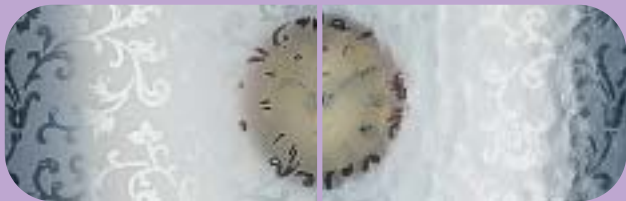
Pilkington Oriel Brocade ™

With a superb range of designs, together with diffused glass options for each design, this premium range of etched glass adds a touch of style and elegance to your home.