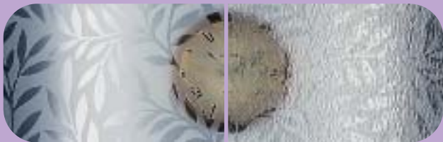
Pilkington Oriel Laurel ™