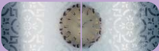
Pilkington Oriel Canterbury ™