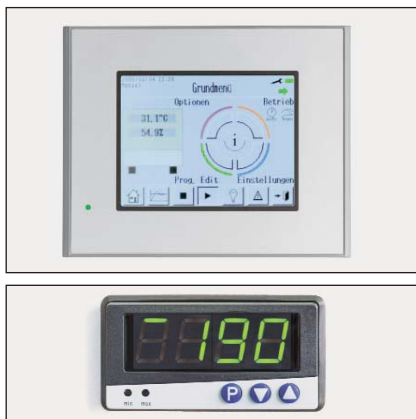
Touchpanel and independent adjustable temperature limiter