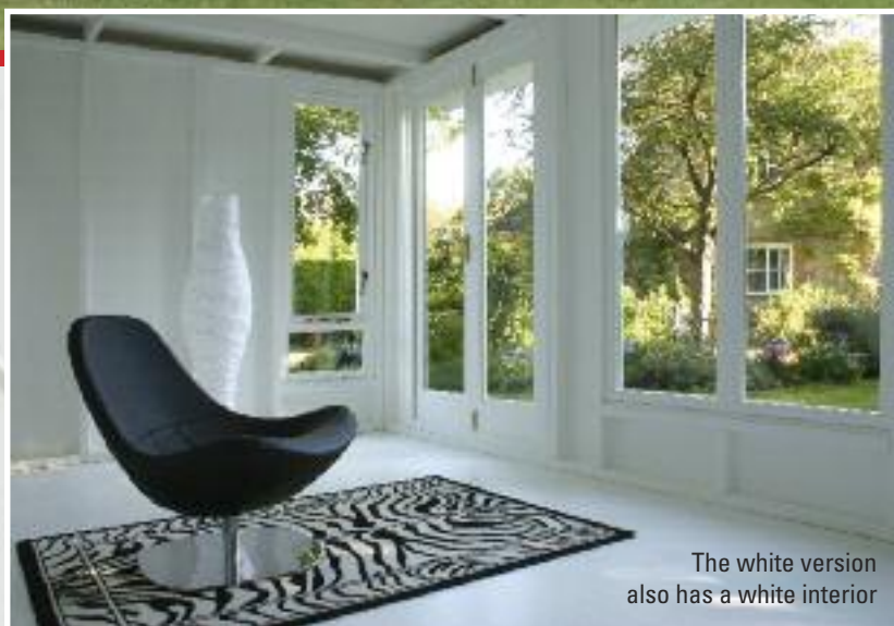
The white version also has a white interior

The Green Room is a timber framed kit-form 'super shed' available in three sizes. Delivered to you in two-man manageable pre-fabricated sections ready to erect.