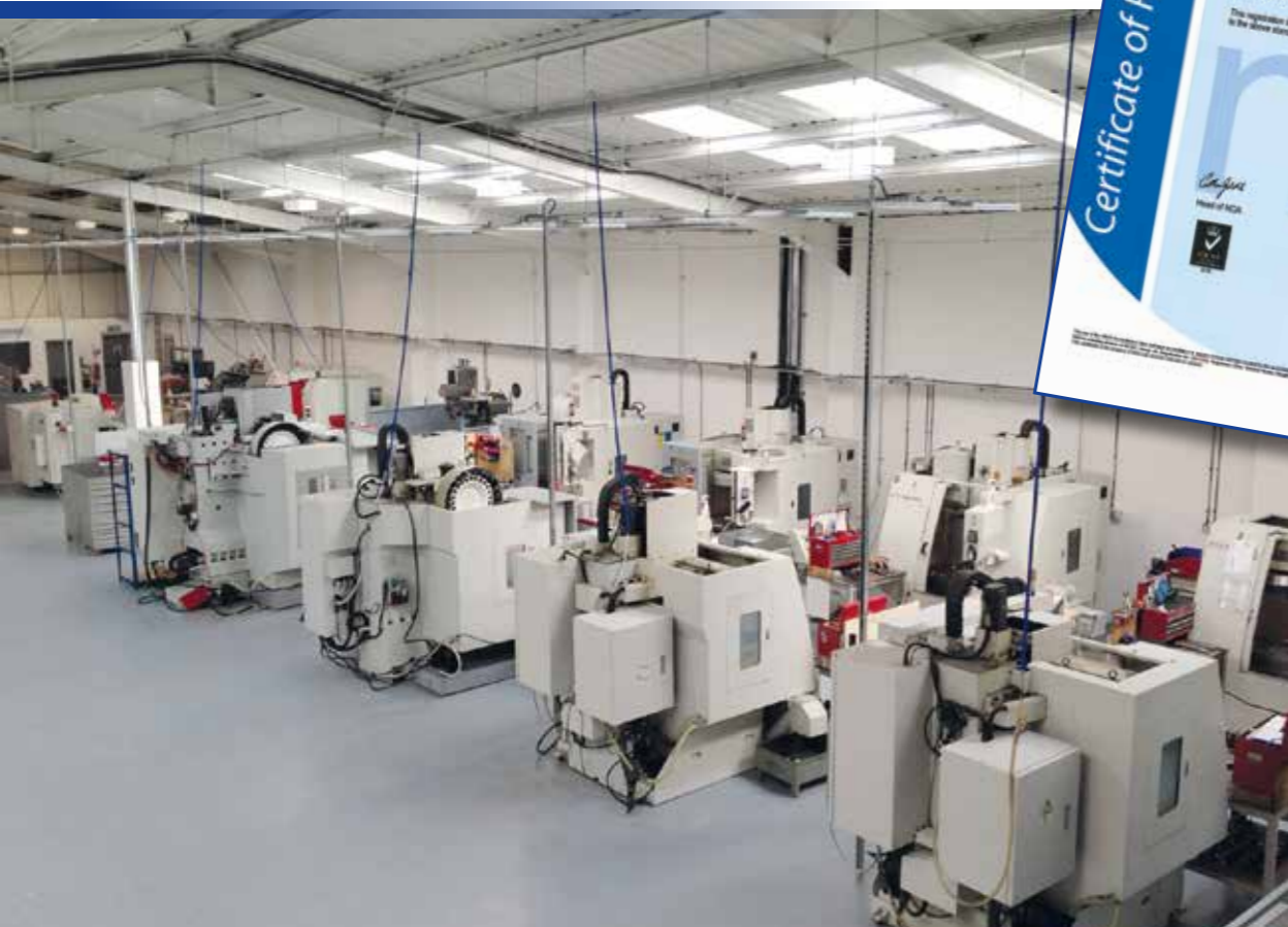
◀ Our new factory in Swillington, Leeds