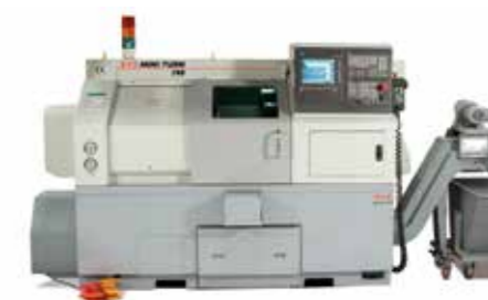
XYZ MINI TURN CHUCK DIAMETER 155mm MAX SWING 400mm MAX TURN 220mm MAX LENGTH 280mm X TRAVEL 185mm Z TRAVEL 325mm QTY 1 OFF