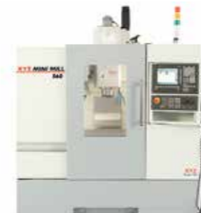
XYZ VMC 560 X TRAVEL 560mm Y TRAVEL 400mm Z TRAVEL 500mm TABLE SIZE 610mm x 370mm QTY 5 OFF