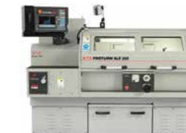
XYZ PROTURN 410 CHUCK DIAMETER 300mm SWING 560mm CENTRES 1000mm QTY 2 OFF