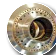
Special Purpose Machinery