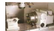
XYZ VMC 1010 with 4th Axis QTY 1 OFF