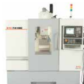
XYZ VMC 710 X TRAVEL 710mm Y TRAVEL 450mm Z TRAVEL 500mm TABLE SIZE 760mm x 430mm QTY 2 OFF