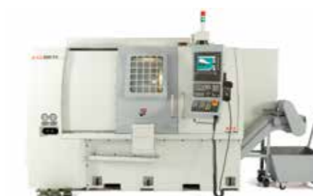
XYZ 250 TC CHUCK DIAMETER 250mm MAX SWING 550mm MAX TURN 250mm MAX LENGTH 650mm X TRAVEL 220mm Z TRAVEL 650mm QTY 1 OFF