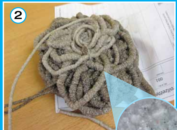
BBU purging clearly shows carbon evident in purge