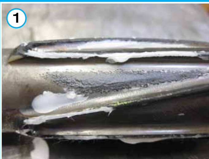
Mixing section of POM Ø30mm screw extracted for photo and replaced “uncleaned”