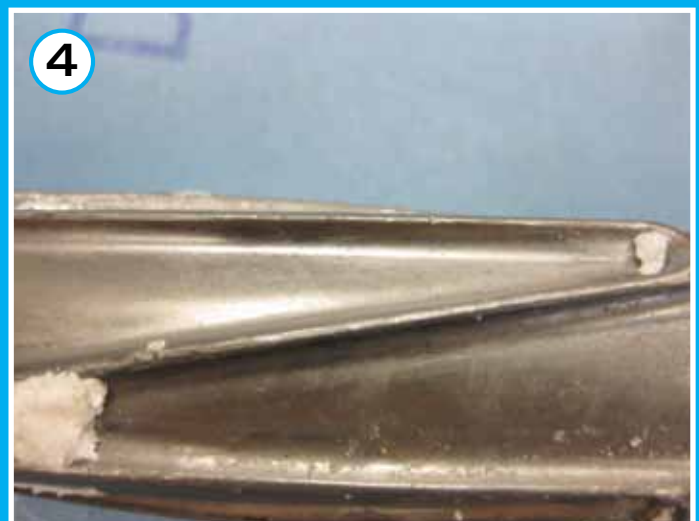
Clean mixing section extracted for photo and inspection