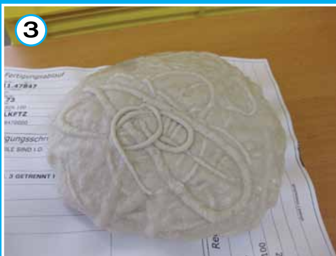
“Clean” BBU purge

If you want to pull the screw after running GF Nylon 66, purge with BBU , reduce heats to 240°C (464°F), purge with some more BBU , dismantle the equipment and remove BBU while hot.