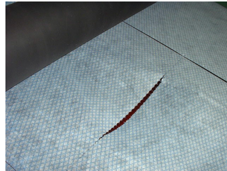
Easy tear perforation on roll.