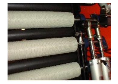
Geared prestretch roller train.