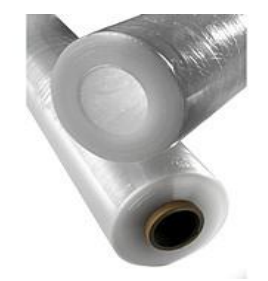
Cored & Coreless capability