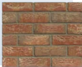
Amesbury Traditional Multi Red Handmade