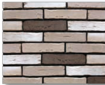
Holbeck Natural Grey