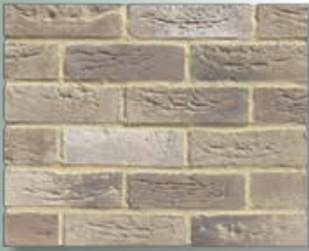
Tonbridge Traditional Brown Sintered