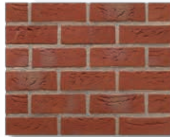
Draycott Red Multi Handmade