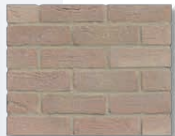
Wimborne Multi Brown Handmade