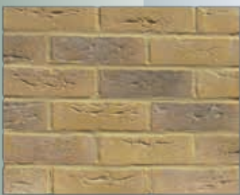
Burwell Weathered Buff Multi