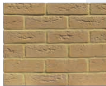
Brandon Original Buff Handmade