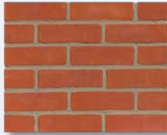
Midhurst Traditional Red Stock