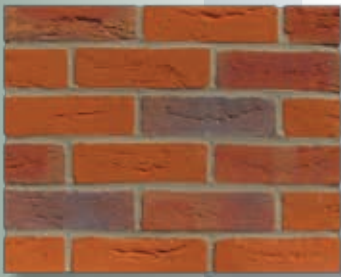
Hampshire Traditional Multi Red Handmade