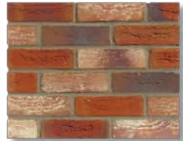
Southwold Multi Red Handmade Mixture