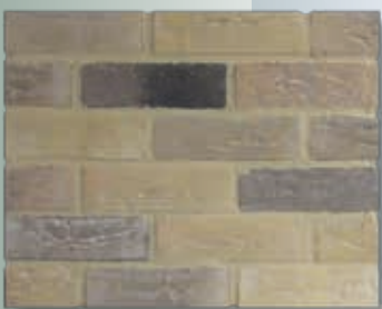
Cambridge Multi Weathered Buff Mixture