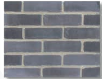
Winchester Charcoal Multi Stock