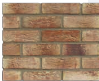
Soham Multi Rustic Handmade