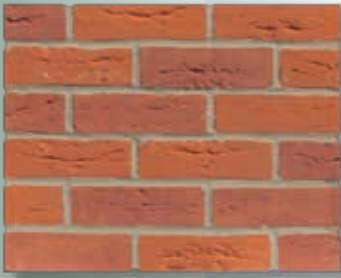
Mildenhall Traditional Multi Red Handmade