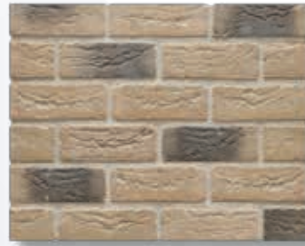
Faringdon Multi Grey Handmade