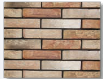
Carburton Multi Handmade