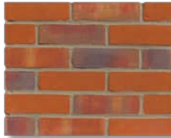
Sussex Traditional Multi Stock