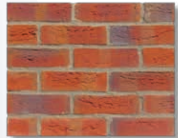
Canterbury Finest Multi Red Handmade