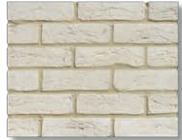
Portland Traditional White Handmade