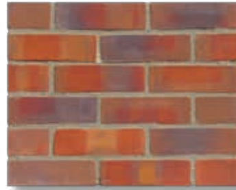
Rochester Finest Multi Red Stock