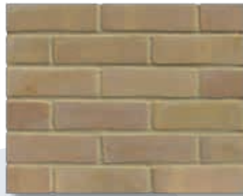
Cottenham Original Buff Stock