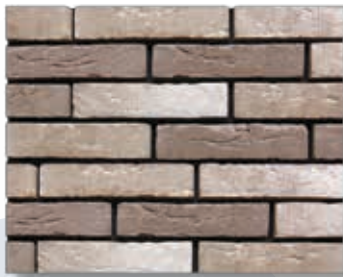
Titchfield Dark Grey Handmade