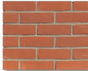
Sevenoaks Red Stock