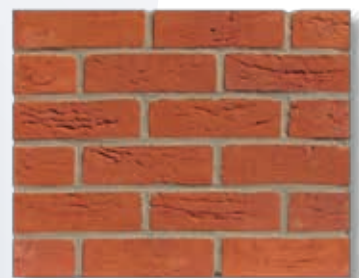
Haslemere Traditional Red Handmade