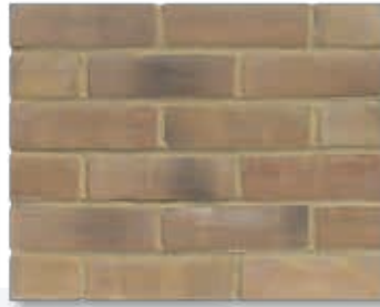
Sawston Original Multi Buff Weathered Stock