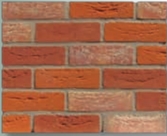
Salisbury Traditional Multi Red Handmade