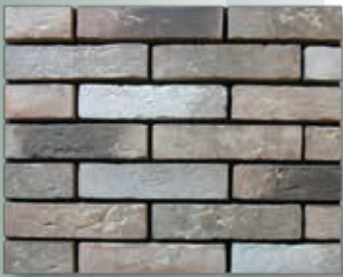
Dukeries Multi Grey Handmade