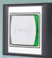
IT 400 SP