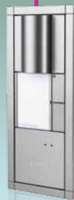
IT 400 SSS