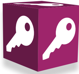
ZEUS® Access Control