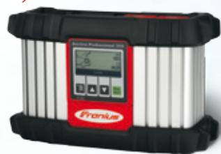
ACCTIVA PROFESSIONAL 35A