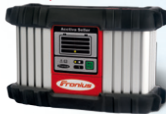
ACCTIVA SELLER 30A