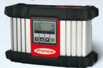
ACCTIVA PROFESSIONAL 35A

VEHICLE WORKSHOP: DIAGNOSIS, SOFTWARE UPDATES, SERVICE