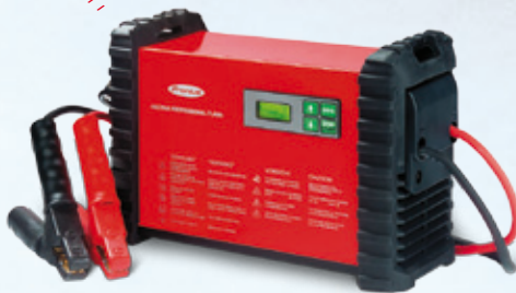
ACCTIVA PROFESSIONAL FLASH 70A