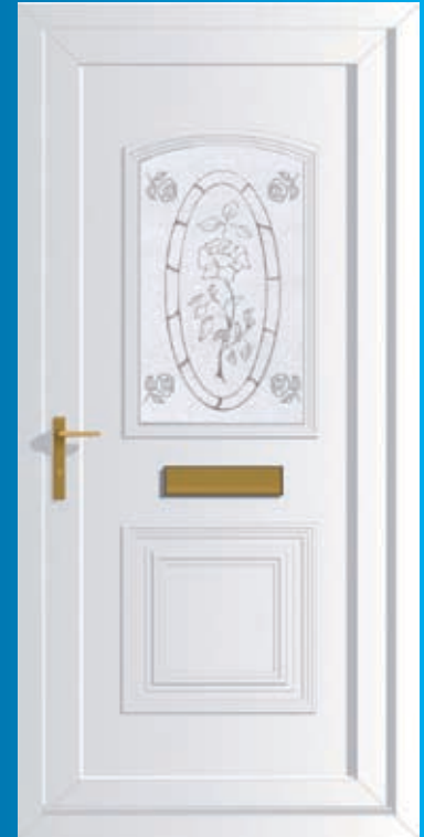
Victorian S1 Wild Rose Etch (TD)

All doors are available in various whites to suite most profiles and a number of woodgrain finishes including mahogany, light oak and rosewood.