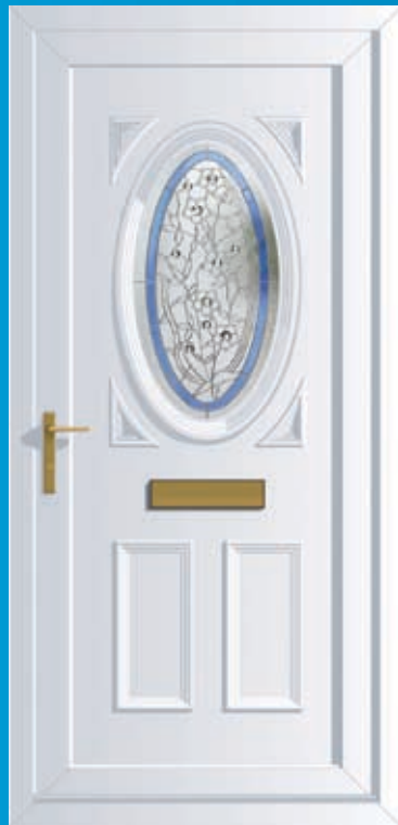
Warwick S1 Tiffany (BP)