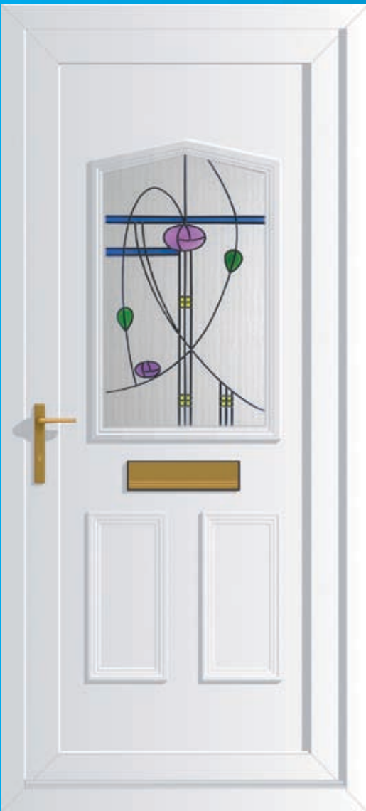
Jacobeau 1 Renni Moray (CD)