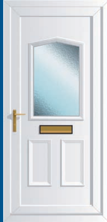
Jacobean 1 Glazed