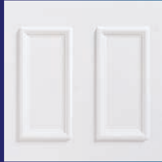
Edwardian Half Panel