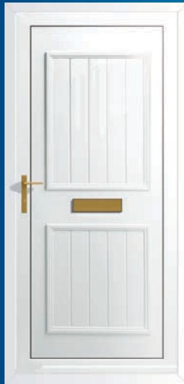
Back Door Solid