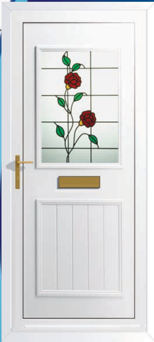
Back Door CD21