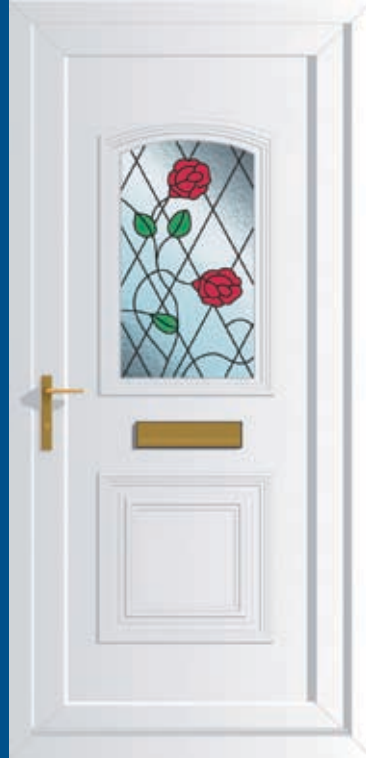
Victorian S1 Briar (CD)