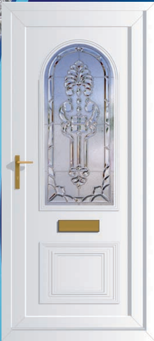
Devon Neptune (BP)