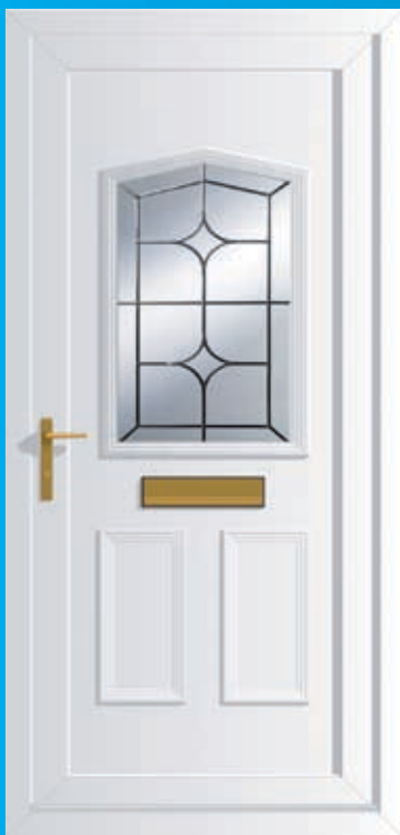
Jacobeau 1 CL2