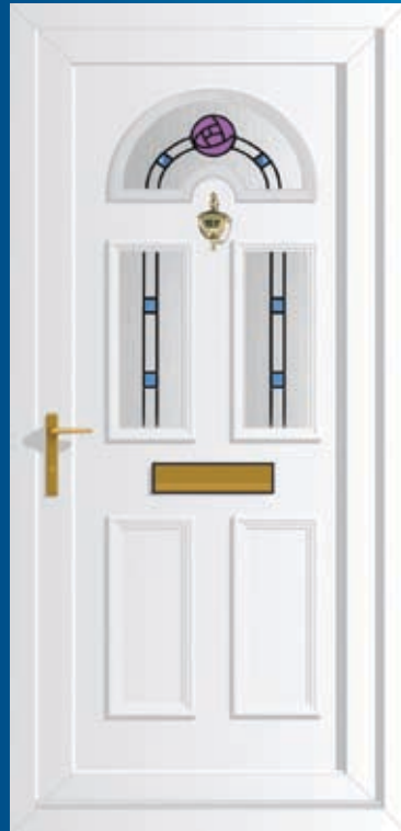
Georgian 3 Renni Islay (CD)