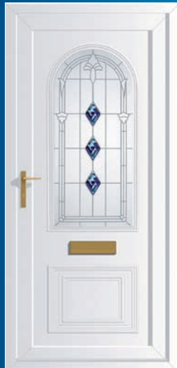
Devon Fused Blue (DB)