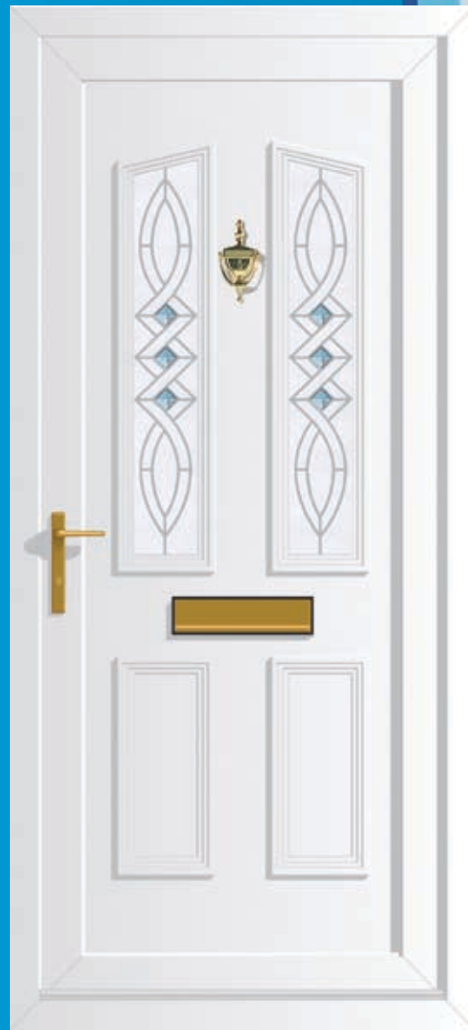
Windsor 2 Sapphire Twist (DB)