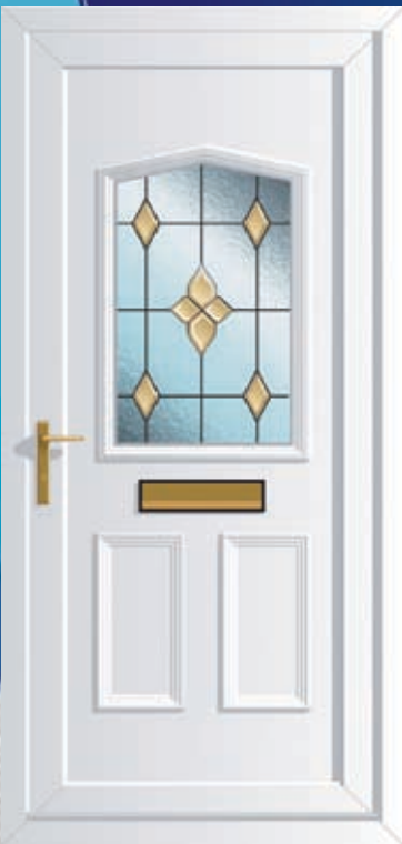
Jacobean 1 Bevel F Coloured