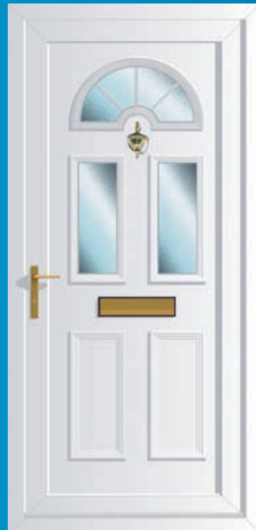
Georgian 3 Georgian Bar