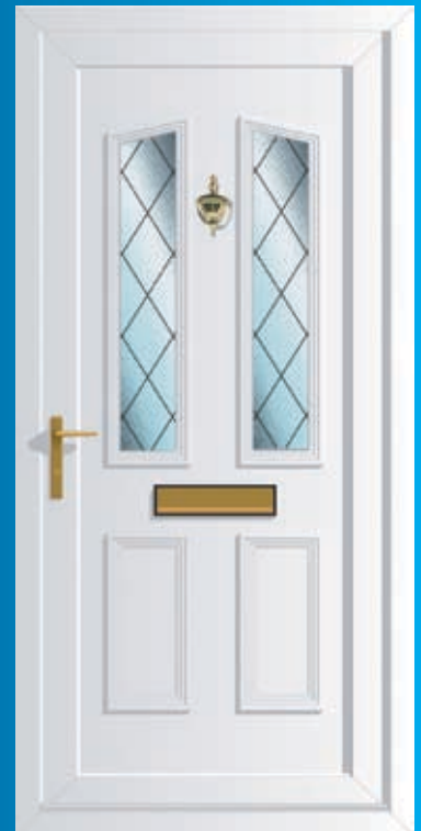
Windsor 2 Diamond Lead