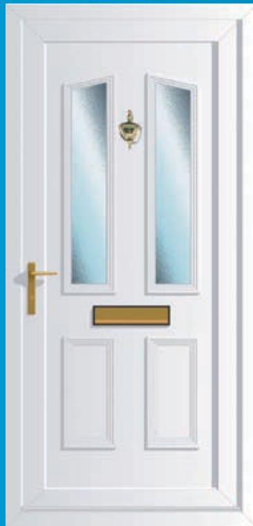
Windsor 2 Glazed