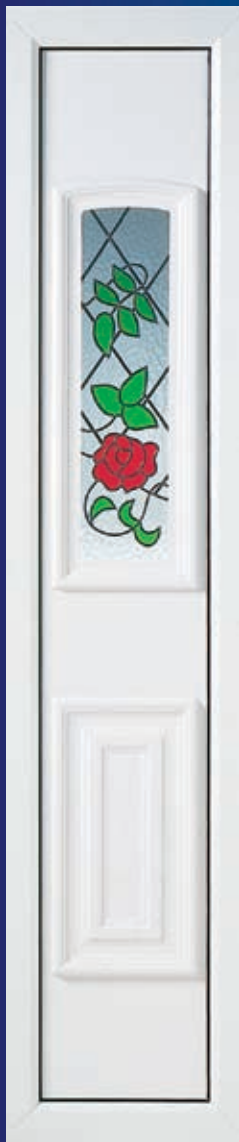
Victorian S/P 1 Climbing Rose