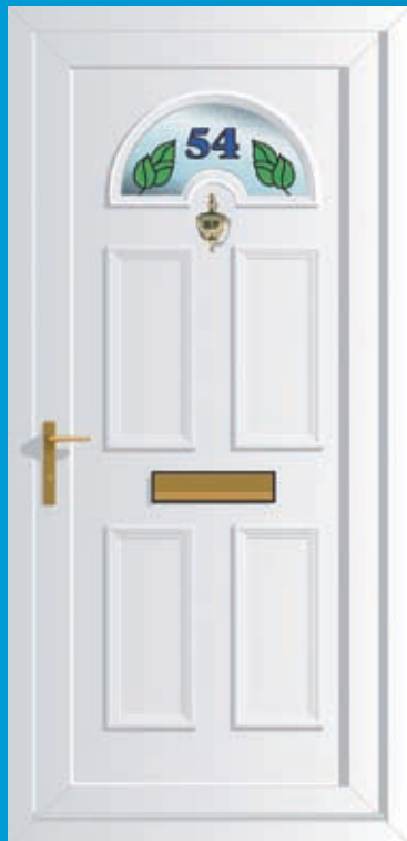
Georgian 1 House No / Leaves (CD)