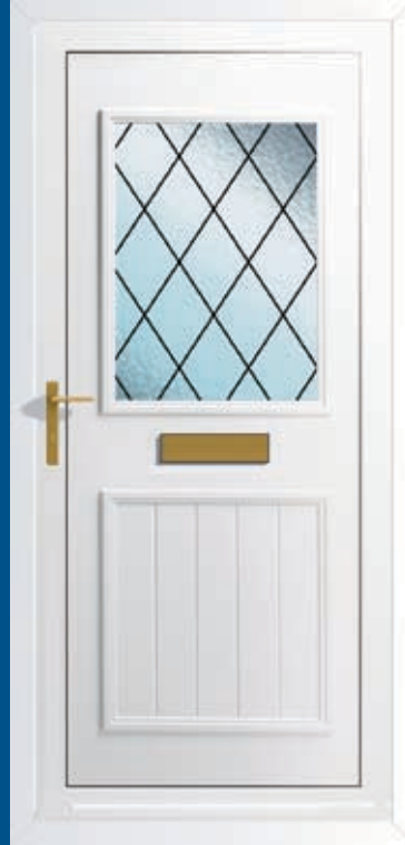
Back Door Diamond Lead