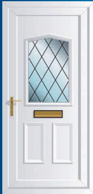
Jacobean 1 Diamond Lead