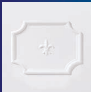
Royale Half Panel