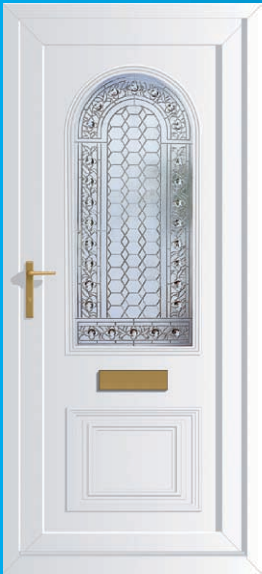
Devon Floral Jewel (BP)