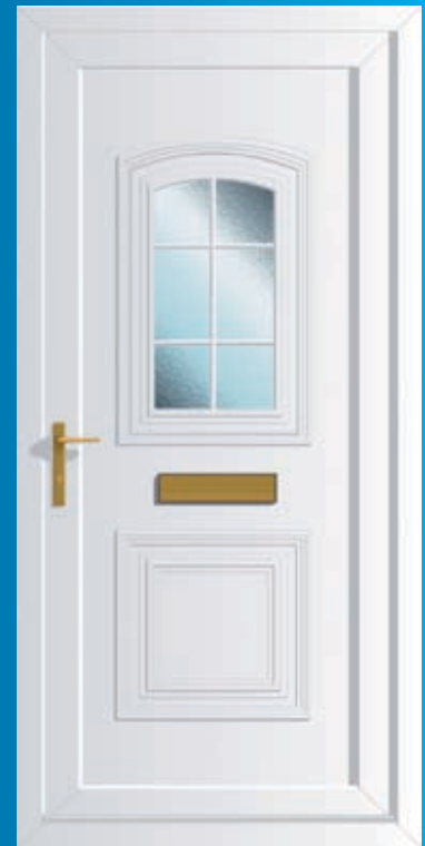
Victorian D1 Georgian Bar