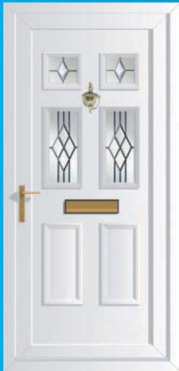
Edwardian 4 DB1