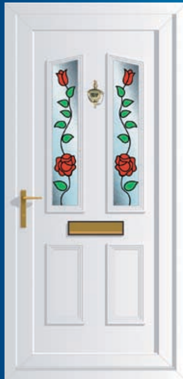
Windsor 2 Climbing Rose (CD)