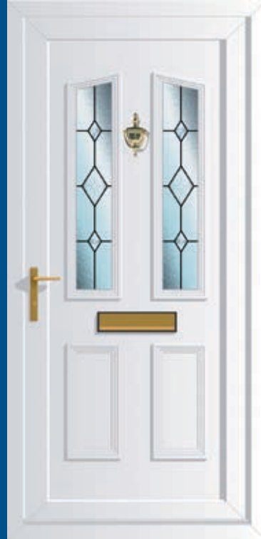
Windsor 2 Bevel Cluster (DB)