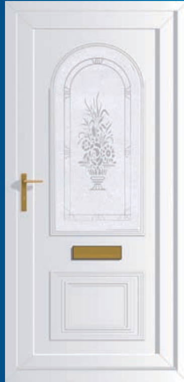
Devon Vase Etched (TD)