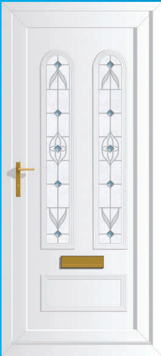
Cambridge Aqua Petal (DB)