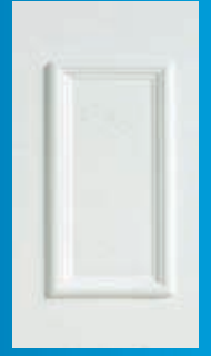
Edwardian Quarter Panel