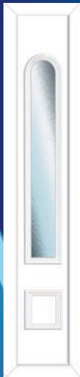
Cambridge S/P 1 Glazed