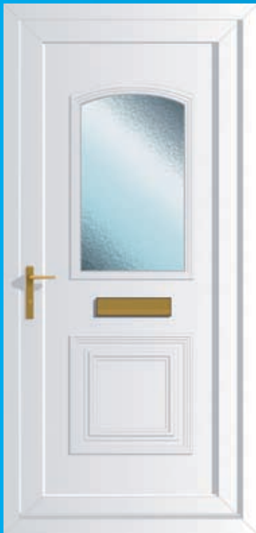
Victorian S1 Glazed