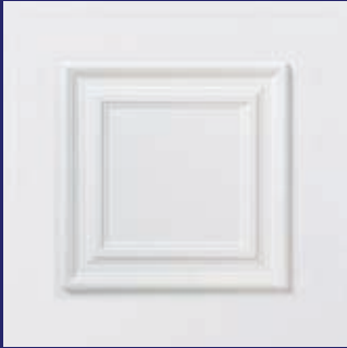
Victorian Half Panel