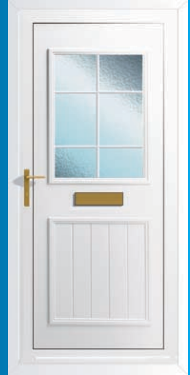
Back Door Georgian Bar