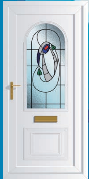
Devon Abstract (CD)