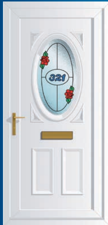
Warwick S1 House No / Roses (CD)