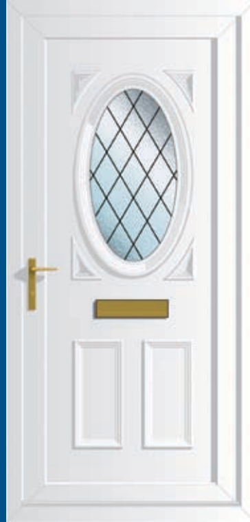
Warwick S1 Diamond Lead