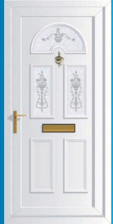
Georgian 3 Floral Urn (TD)