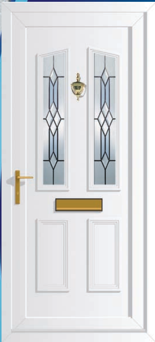
Windsor 2 DB4