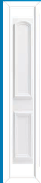
Bordeaux S/P Solid