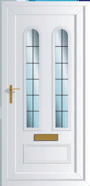
Cambridge Block Lead