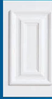
Victorian Quarter Panel