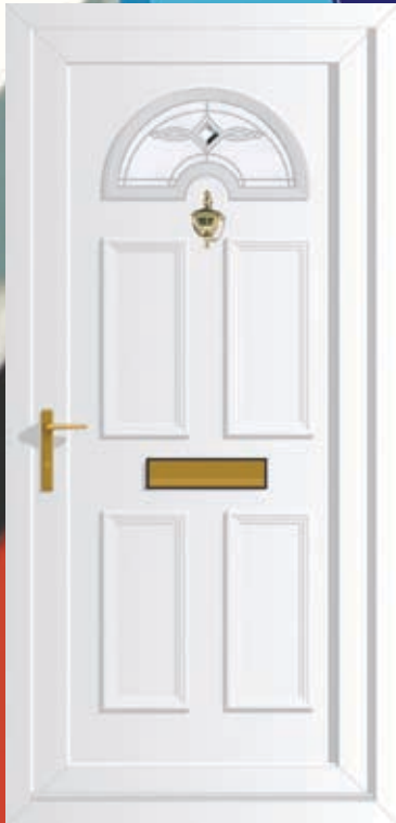
Georgian 1 Clear Elegance (DB)