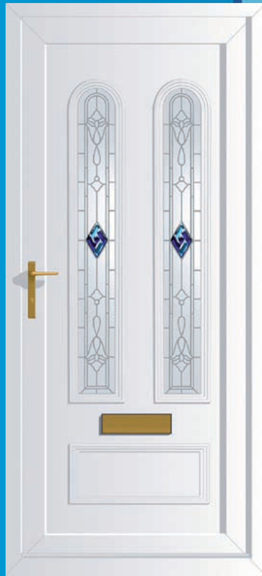
Cambridge Fused Blue (DB)