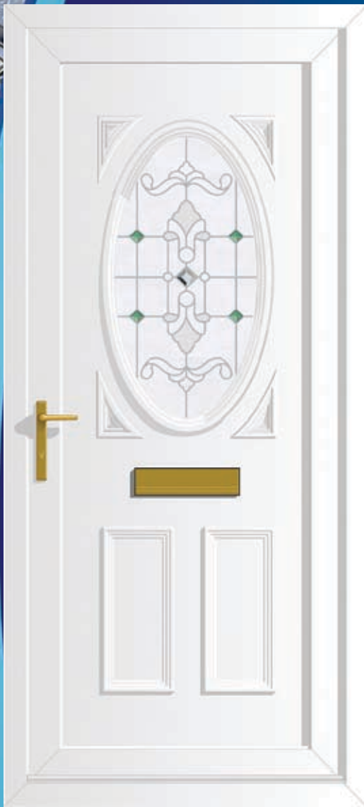
Warwick S1 Emerald Elipse (DB)