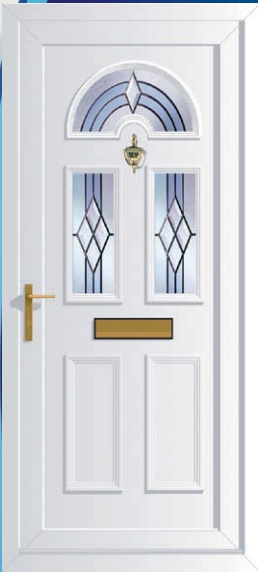
Georgian 3 DB8