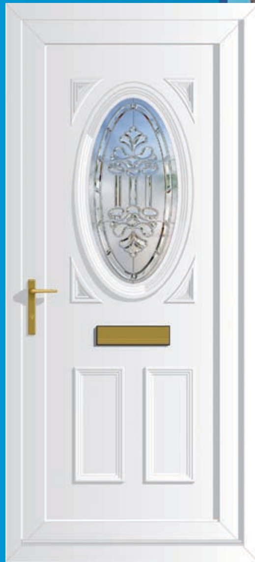
Warwick S1 Aquarius (BP)