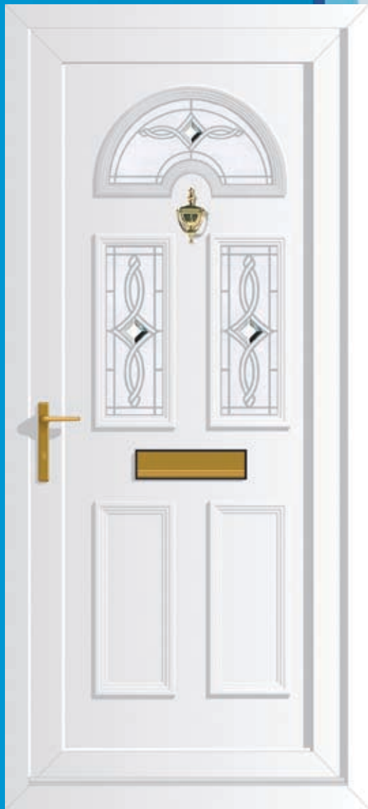
Georgian 3 Clear Elegance (DB)