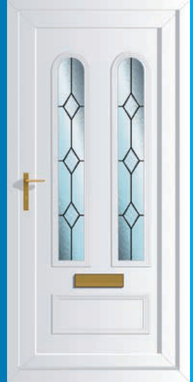
Cambridge Bevel Cluster (DB)