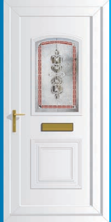
Victorian S1 Ruby