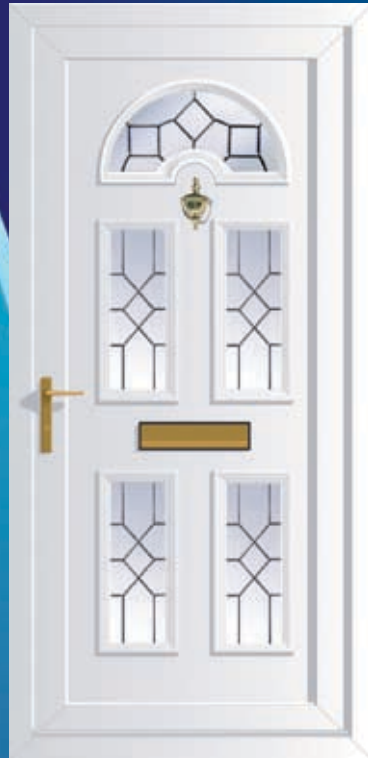
Georgian 5 CL5