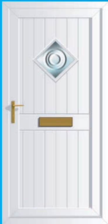
Cornwall Bullion (CD)