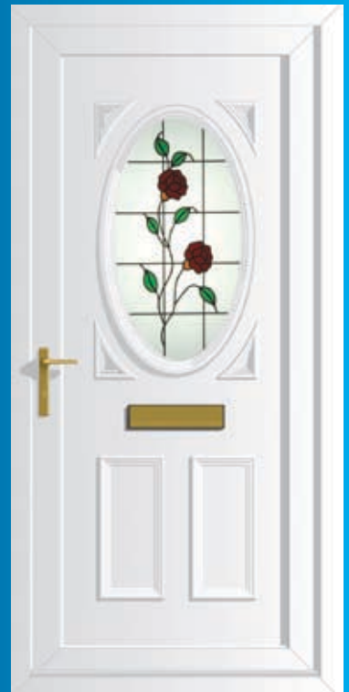
Warwick S1 CD21