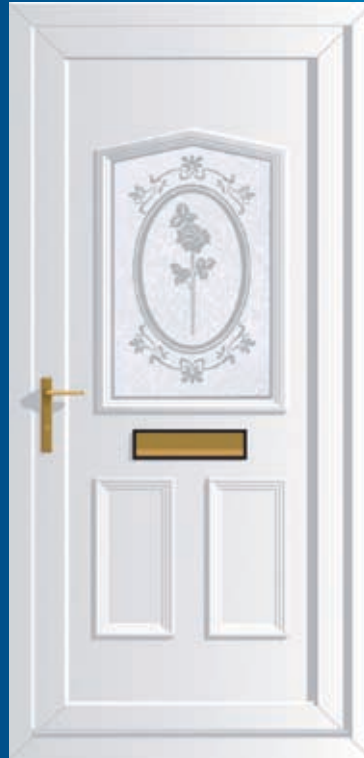
Jacobean 1 Tea Rose Etch (TD)