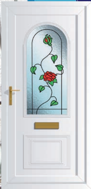
Devon Wild Rose (CD)