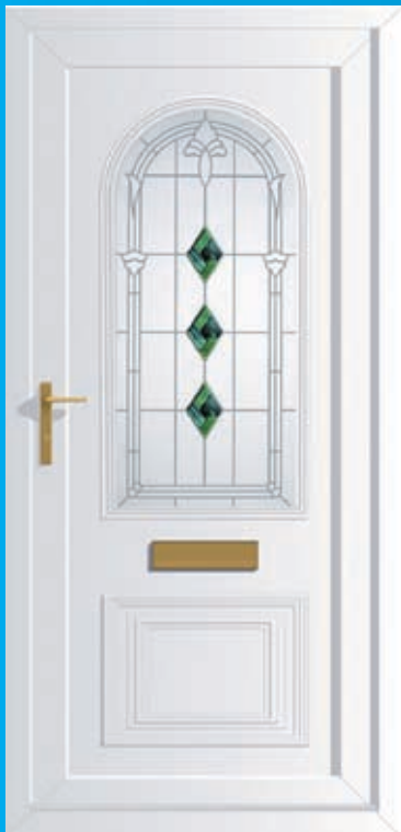
Devon Fused Green (DB)