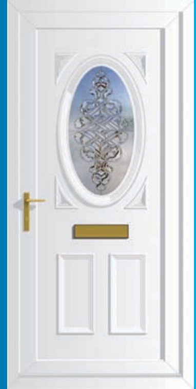
Warwick S1 Gemini (BP)