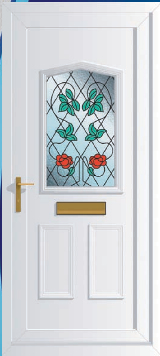
Jacobean 1 Climbing Rose (CD)