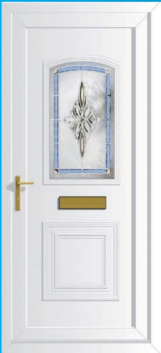
Victorian S1 Cobalt (DB)