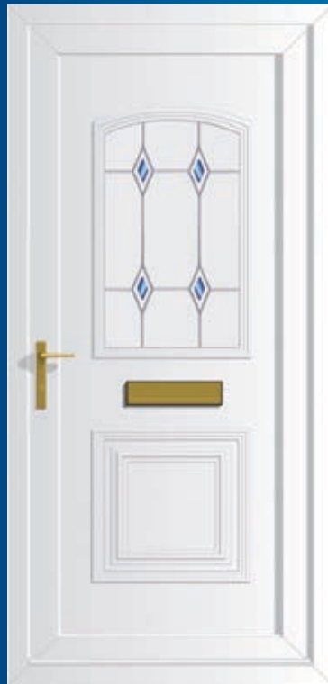
Victorian S1 Fused Grille (DB)