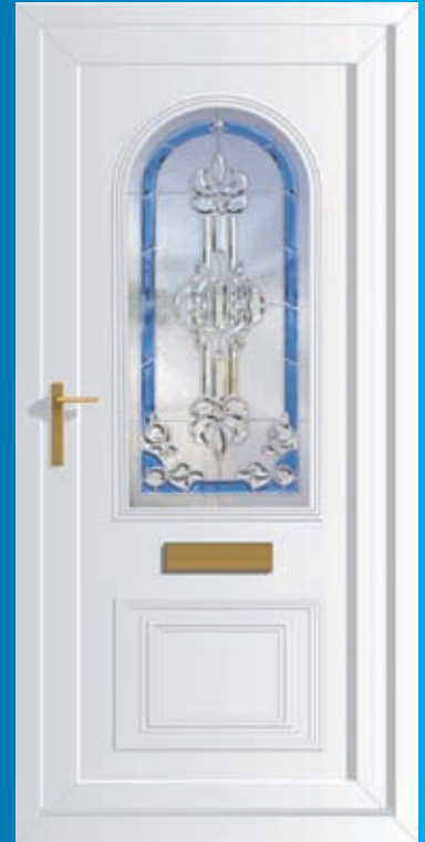
Devon Venus Lapis (BP)