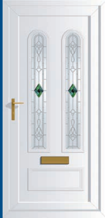
Cambridge Fused Green (DB)