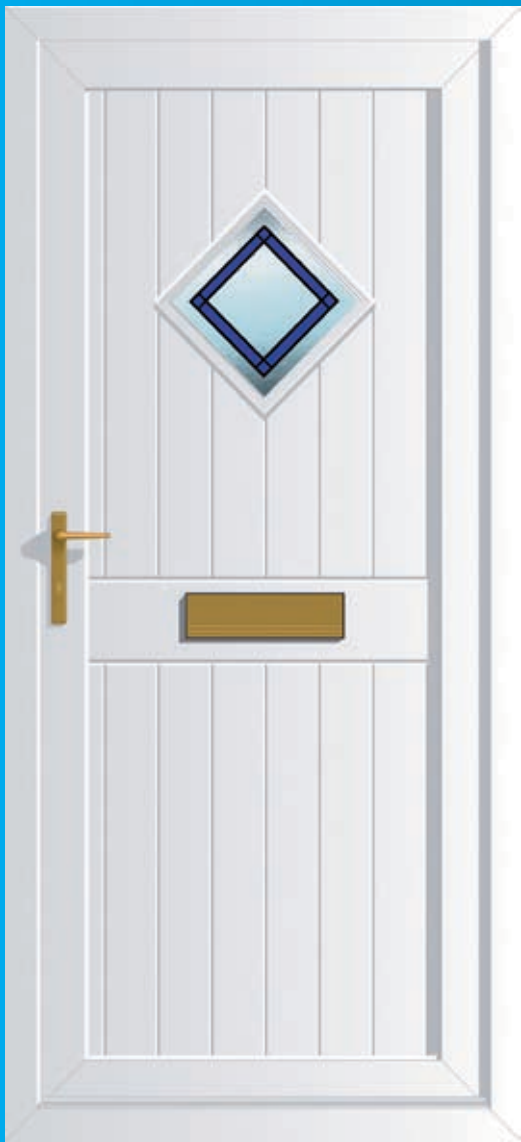
Cornwall Blue Border (CD)