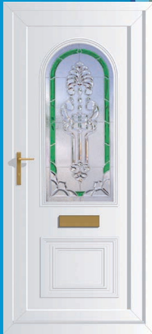
Devon Neptune Emerald (BP)