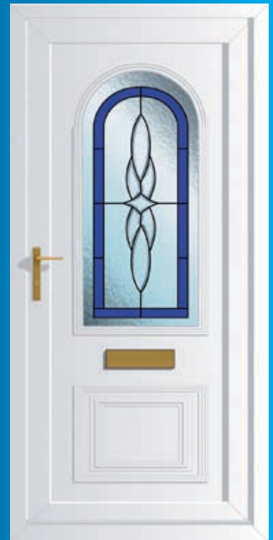
Devon Royale Bevel (DB)