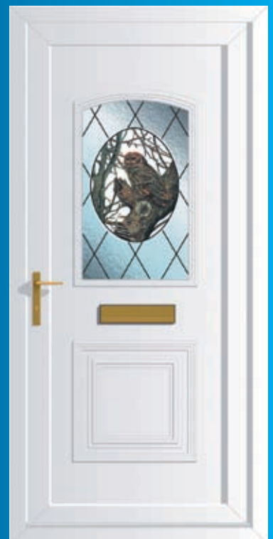
Victorian S1 Owl (CD)

This offers a high degree of thermal efficiency and, by using our range of reinforcing options, a high degree of security.