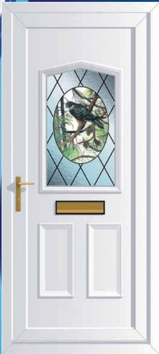
Jacobean 1 Hawk (CD)