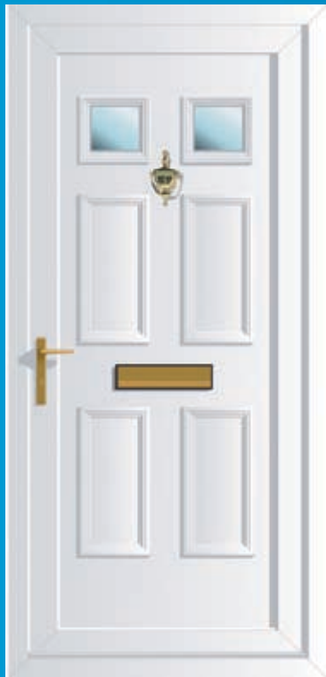
Edwardian 2 Glazed