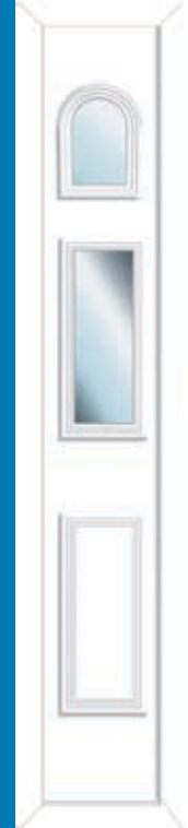
Georgian S/P 2 Glazed