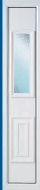
Victorian S/P 1 Glazed