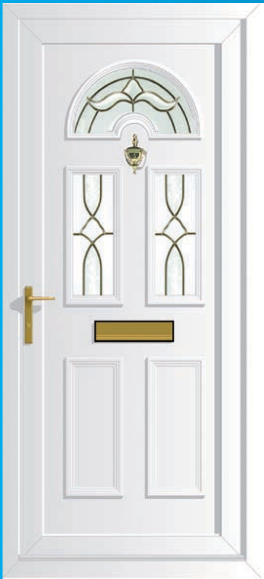
Georgian 3 Sirius (DB)