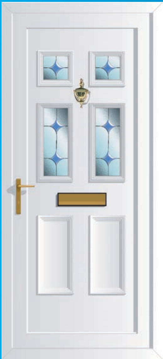
Edwardian 4 Bevel G