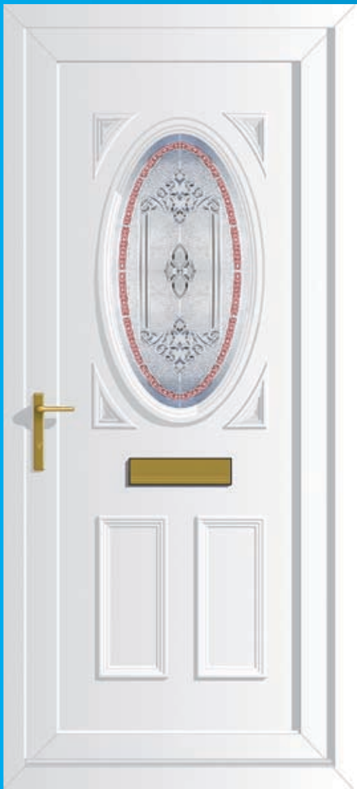
Warwick S1 Bright Ruby (BP)