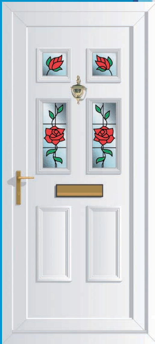
Edwardian 4 Climbing Rose (CD)