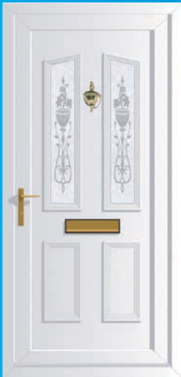
Windsor 2 Floral Urn Etched (TD)