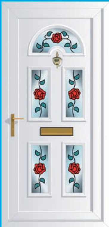
Georgian 5 Rambling Rose (CD)