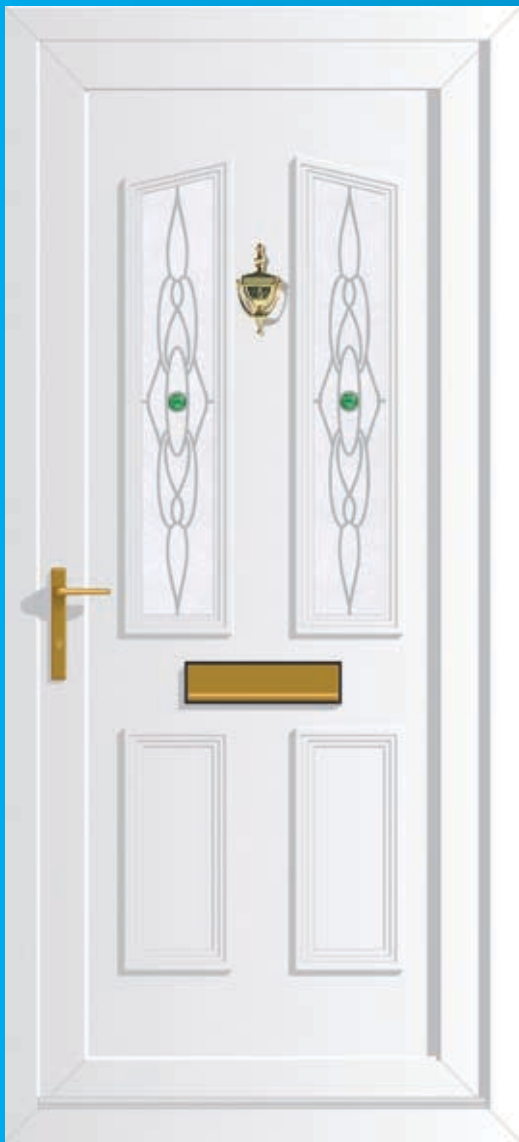
Windsor 2 Emerald Jewel (DB)