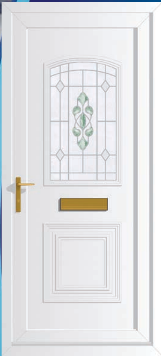
Victorian S1 Tinted Emerald (DB)