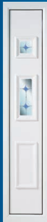
Edwardian S/P 2 Bevel G