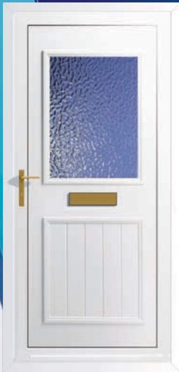
Back Door Glazed