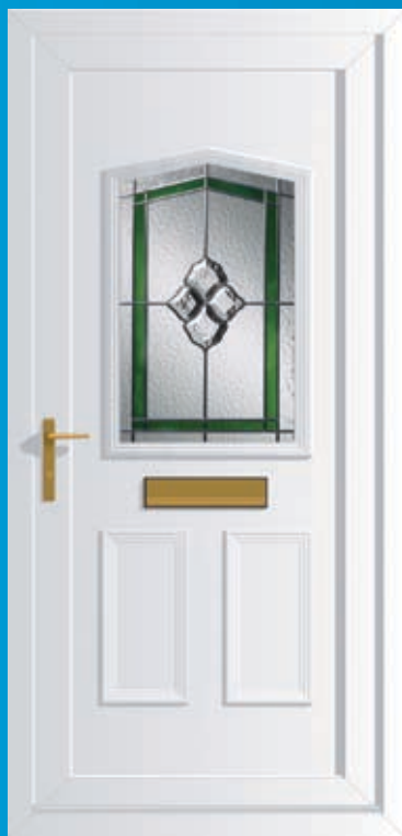
Jacobeau 1 DB2