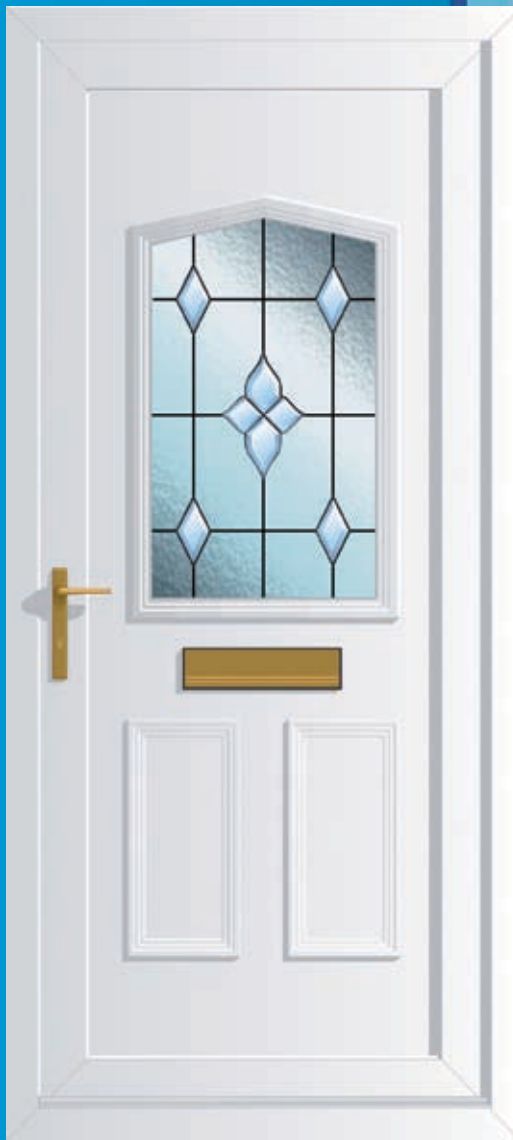
Jacobeau 1 Bevel A (DB)