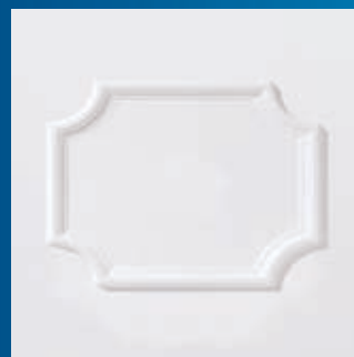
Regency Half Panel