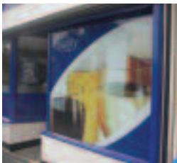
Photographic film image

Our range of film specifications allows flexibility in the degree of protection from impact damage, vandalism, bullet-proofing or bomb-blast protection whilst still allowing light and vision, one-way or both ways.