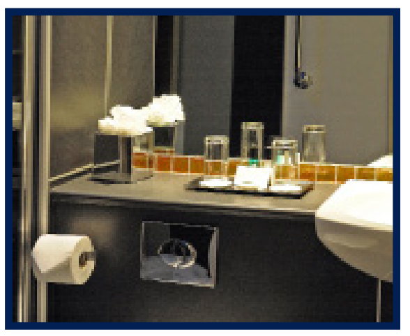
Matching multiPANEL vanity tops