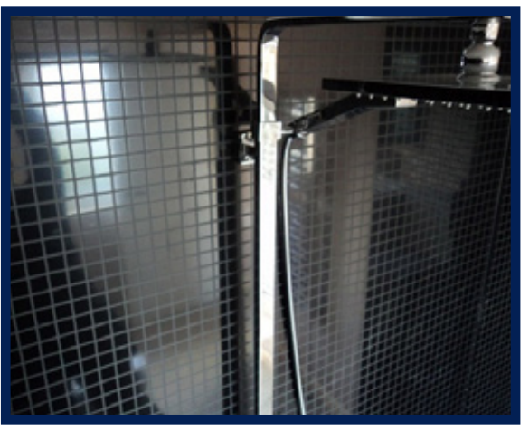
tilePANEL with embossed grout lines