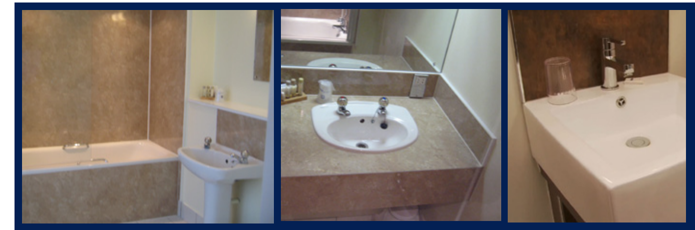
multiPANEL has numerous applications, so off-cuts can be used for bath panels, vanities and splash backs.