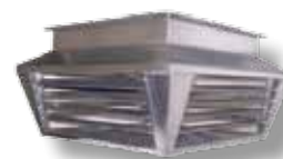
4 way diffuser box