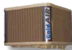
Roof top model RA