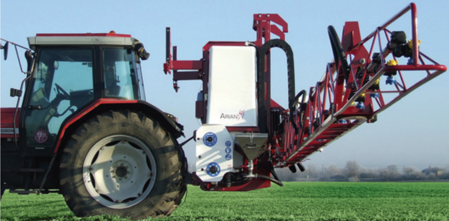
1500L with 24m boom

British designed and built for British farmers