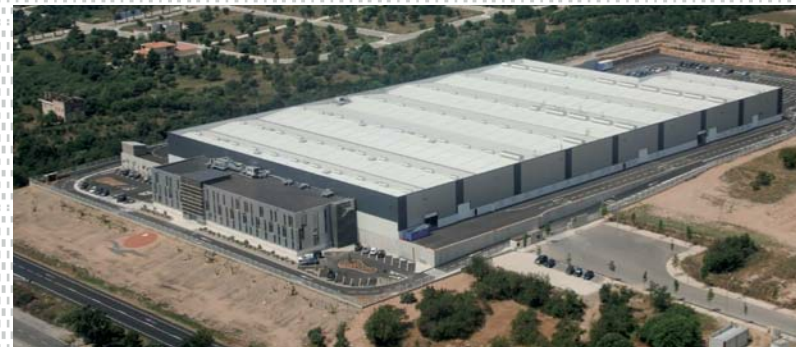
The Llaza headquarters has facilities that cover more than 50.000 m 2 ; 26.000 m 2 of which have already been built. The complex began operation at the end of 2008.