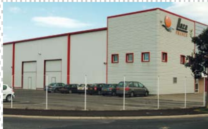
Llaza France has 5.000m 2 at it seat in Perpignan.

Llaza has a wide and varied range of solar protection products, exclusive systems which are designed and manufactured with the latest technologies and in accordance with the strictest European quality standards. Llaza has an ample portfolio of products to provide the right solution for every need.