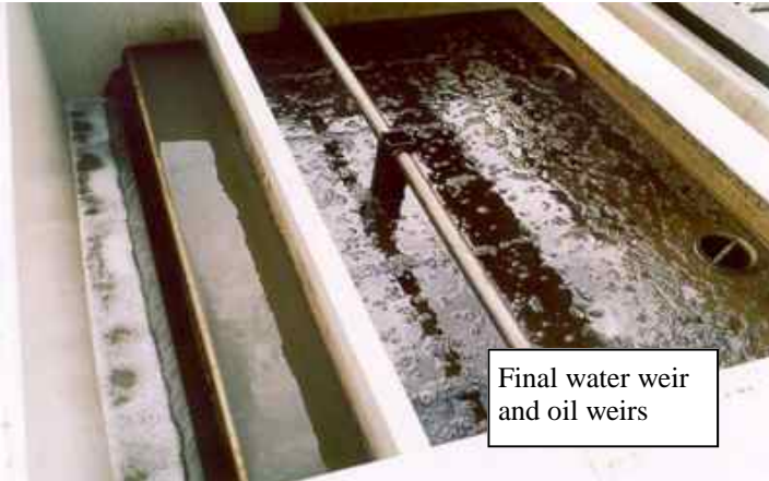
Final water weir and oil weirs

If necessary, drag conveyors can be provided beneath the initial stages to remove suspended solids as they are precipitated. Alternatively, sludge draw-off points can be provided for removal by tanker. Provision can be made and plant provided for the addition of chemicals to assist in both solid and oil separation.