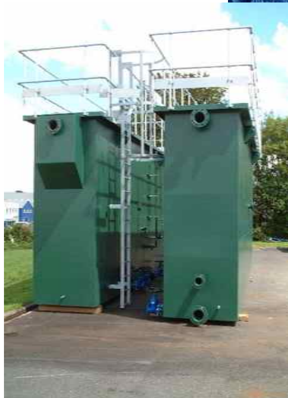
Typical Stetpack SS180 separators with inlet end seen on LH unit and outlet end on RH