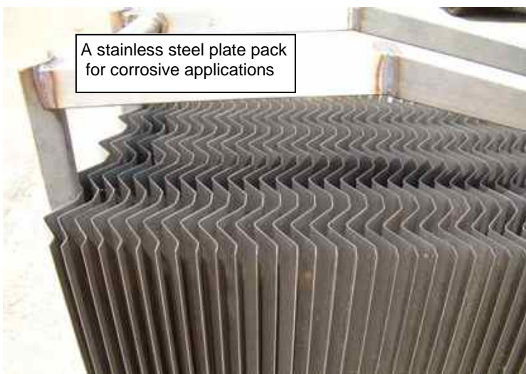
A stainless steel plate pack for corrosive applications

We can supply a full kit of parts for in-ground concrete sumps, i.e. plate packs, weirs, support frames, media baskets, etc. These units can be supplied for flow rates of 1m 3 /h to 1000m 3 /h