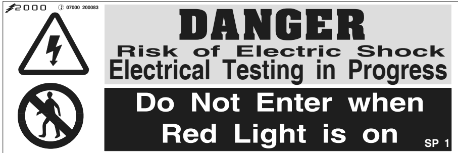
SP 1 600x200mm

600x200mm £9-00 + Vat 400x300mm £6-00 + Vat 225x 75mm £3-00 + Vat