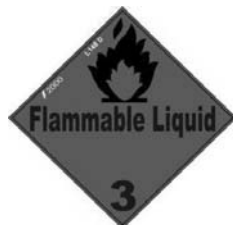
L148 D Flammable Liquid Diamond for Jerry Cans, Bowsers, Fuel Tanks & Stores. Use with Gas Oil, Diesel and Petrol for Gas Oil Bowsers & Tanks