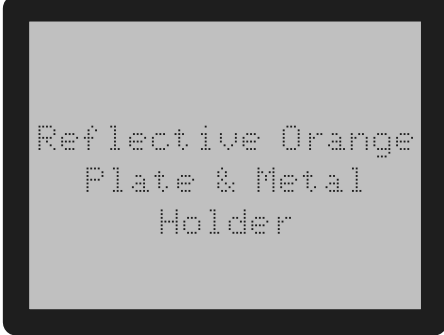
SP23-2000 Hazpack Holder & Sign for Vehicles (2 Required)

Semi-Rigid PVC Signs from 2000 Test Equipment. Sizes as shown