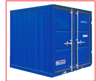
6ft Mini Store - £10 per week