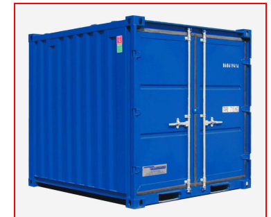
8ft Mini Store - £15 per week