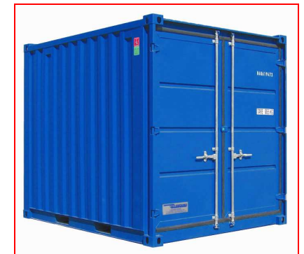
10ft Mini Store - £20 per week