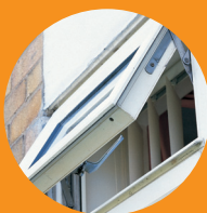
OLD single point locking

Modern PVCu windows and doors not only look better but lock better with multi-point locking configurations offering you increased protection.