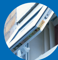
NEW multi-point locking