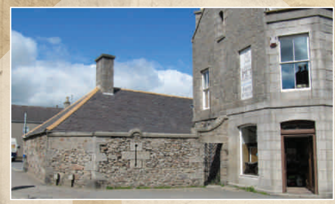
4 months work will see a total transformation

We also renovate commercial properties. The Old Bakery is our latest project, involving the conversion of former bakery premises into modern retail space.