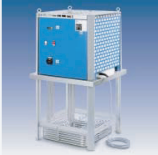
TRK - Immersion chiller for cooling lubricants with a cooling capacity of 2 to 75 kW. Service-friendly in maintenance and cleaning.

In addition to our standard product range, we offer you solutions for liquid cooling in all industrial applications. Our systems are available in compact or split design, air or water cooled. Continuous-flow coolers and expansions with cleanable plate-type heat exchangers are just as available as versions with special voltages. Our sales team of engineers and technicians is always available to you for comprehensive consultation. Do not hesitate, we are awaiting your enquiry!