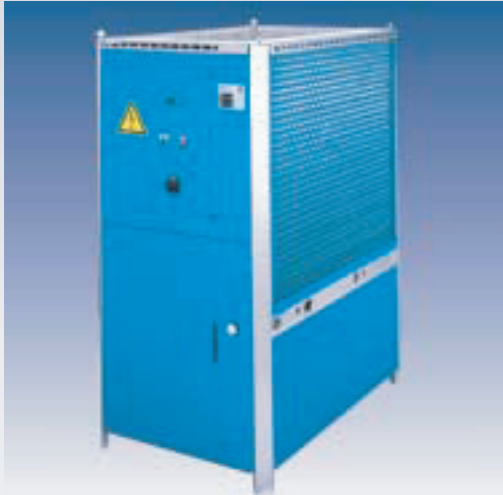
SVK - Water chiller with a cooling capacity of 15 to 70 kW, with tank and pump. Compact design with high temperature accuracy.