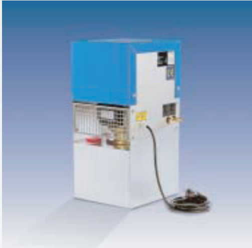
LWK - Air-type water recooler without refrigeration system with a cooling capacity of 2 to 2.5 kW, with tank and pump. The low-cost alternative for applications with higher water operating temperatures.