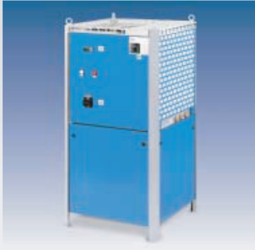
VWK/1 - Water chiller with a cooling capacity of 2 to 15 kW, with tank and pump. Compact design with high temperature accuracy.