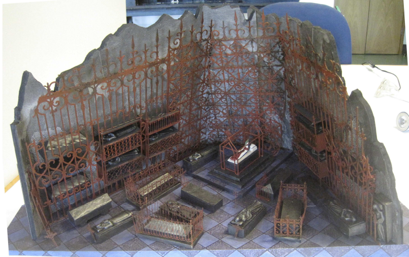
Above: Photograph of the model of the set Below: Photograph of the completed set in use

Wishing all of our customers a happy New Year and looking forward to a prosperous and successful 2013! At Hydromar we have a very wide range of customers, servicing many sectors, including aerospace, automotive, defence, marine, renewables, oil & gas and civil, as well as supporting many individuals with one-off projects. Less commonly we also do work within the arts sector. A piece of work we cut profiles for stands in Fillmore Gardens in San Francisco. More recently we had the privilege of working with the Royal Opera House to produce part of the set for Act III of the opera Robert le Diable, which premiered last month. The work consisted of profiling lots of panels in 20mm thick lightweight skinned PVC, which would be mounted on a steel frame to represent massive wrought iron railings.