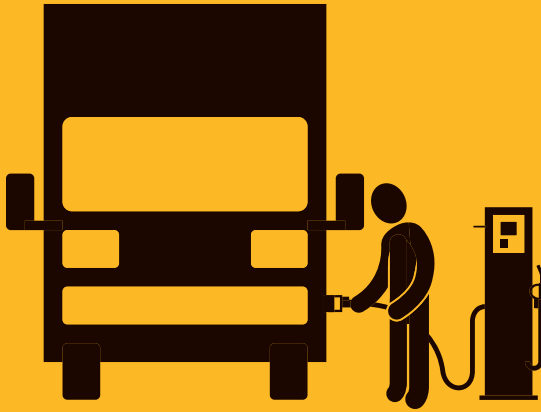
DATADISK READER IDENTIFYING VEHICLE AND CAPTURING MILEAGE READING.