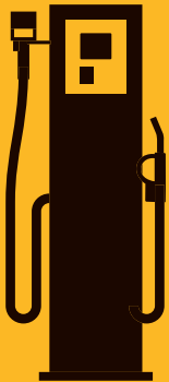
DATADISK READER IN STORAGE POSITION.

FUELTEK DATADISK is available with a number of options. The datadisk reader can simply be attached to an umbilical cable (up to 10 mtrs) and mounted like a nozzle on the side of the FT4000 or it can be mounted on a retractor to provide longer life and even easier use. The DATADISK can be tailored to the requirements of your site and can be mounted on boom arms or overhead fittings if required.