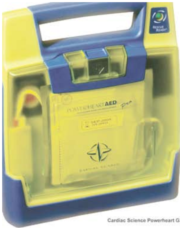
Cardiac Science Powerheart G3 Pro