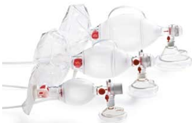
Ambu SPUR II BVMs