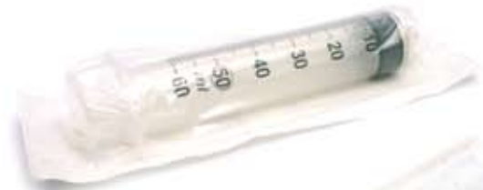
Luer Slip Tip Syringes