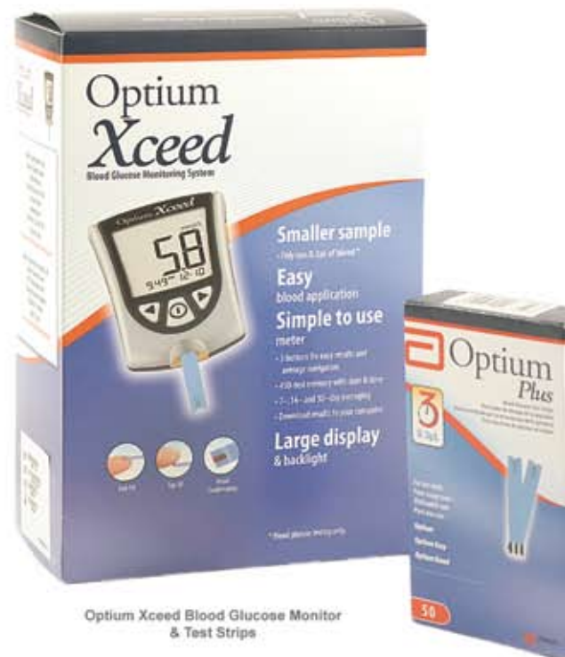
Optium Xceed Blood Glucose Monitor & Test Strips