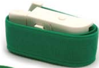
Quick Release Tourniquet