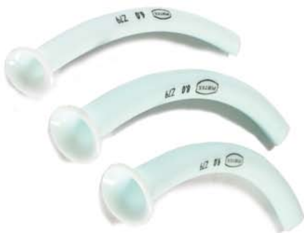
Portex Nasopharyngeal Airways

The Argyle Nasopharyngeal Airway provides an open airway to make suctioning and bronchoscopy easier, safer and less traumatic. It's Glide- TM serrations inside airway smooth passage of catheter, the Slide- TM exterior finish facilitates non-grabbing insertion.