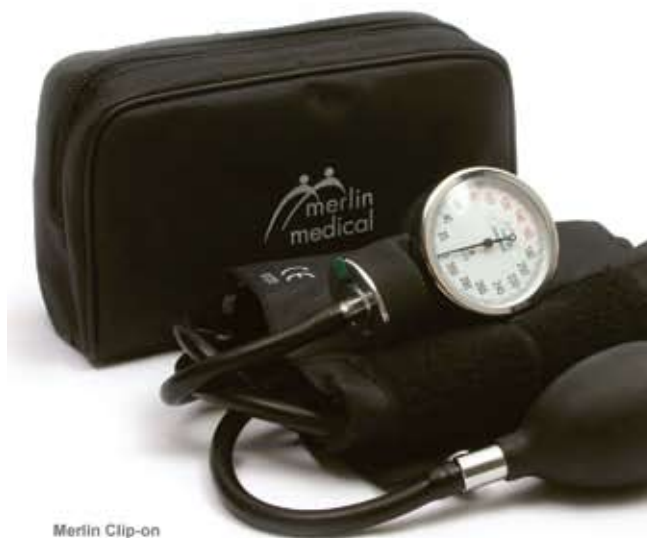
Merlin Clip-on Sphygmomanometer