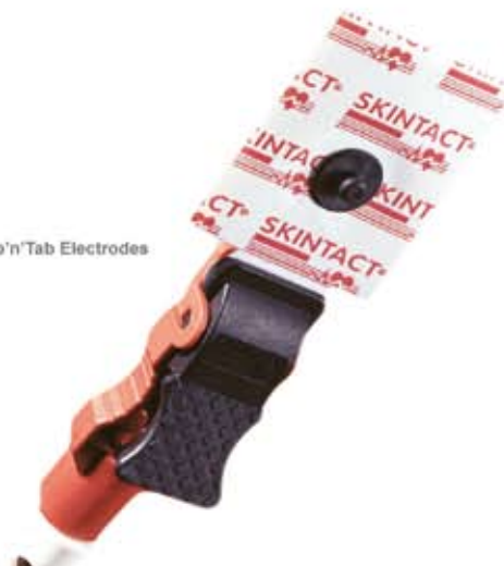
SKINTACT Snap'n'Tab Electrodes