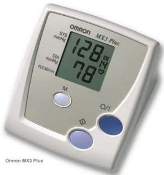
Omron MX3 Plus

220517 100 x TempaDOT Thermometer Strips