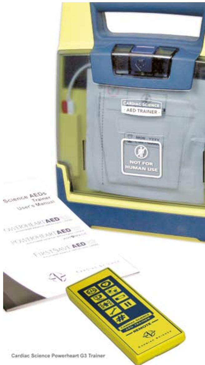
Cardiac Science Powerheart G3 Trainer