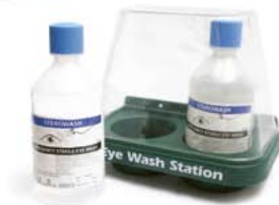
Eye Wash Station