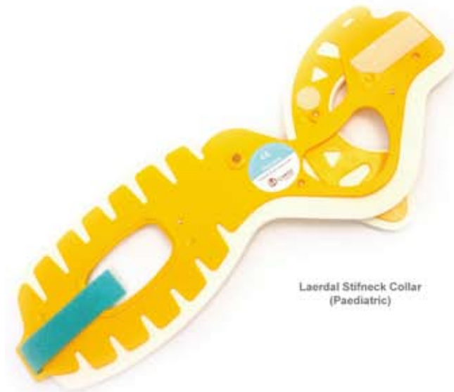
Laerdal Stifneck Collar (Paediatric)