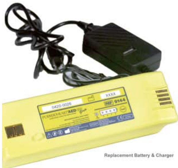
Replacement Battery & Charger