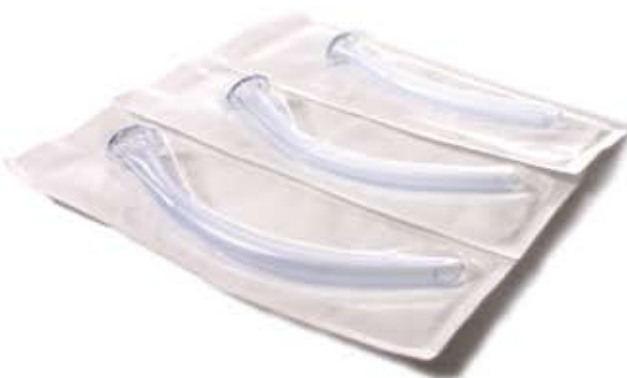
Argyle Nasopharyngeal Airways

The nasopharyngeal airway facilitates suctioning in intensive care and also provides an alternative airway during accident and emergency procedures when the oropharyngeal pathway is occluded.