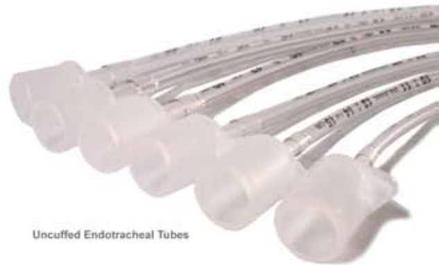
Uncuffed Endotracheal Tubes