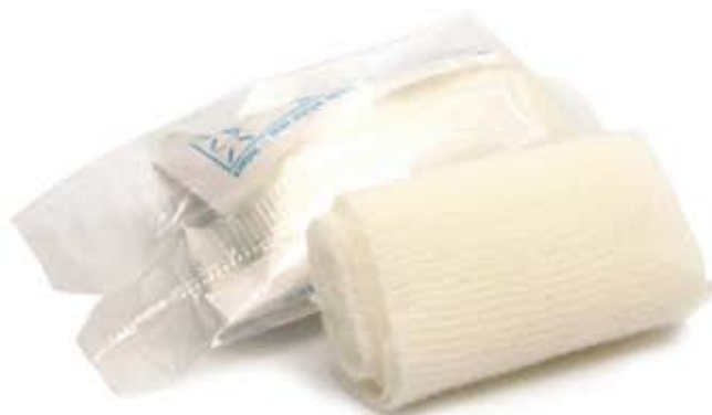
Sterogrip Elasticated Tubular Bandage