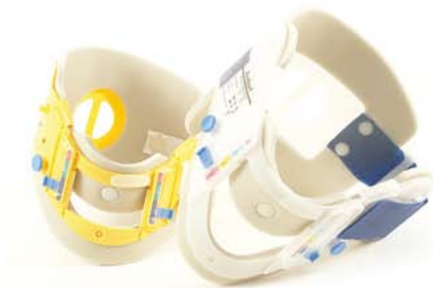
Ambu Perfit ACE & Mini Perfit ACE