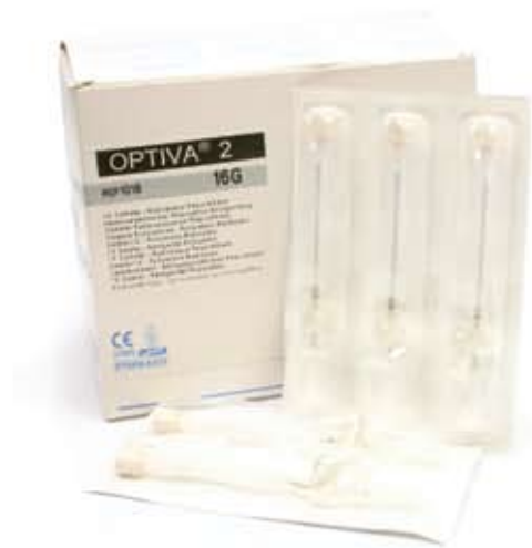
Optiva 2 Cannulae