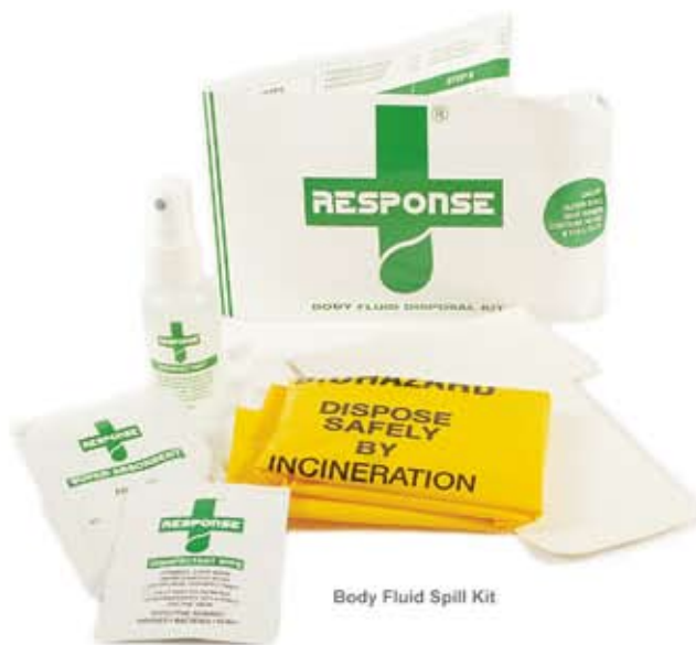
Body Fluid Spill Kit