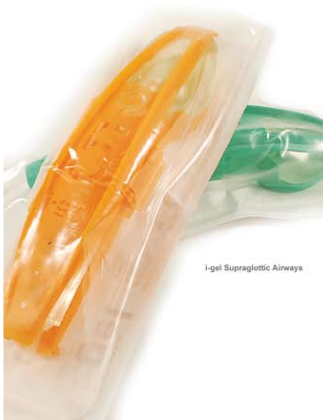
i-gel Supraglottic Airways

210234 Intersurgical Solus Laryngeal Mask - Size 5