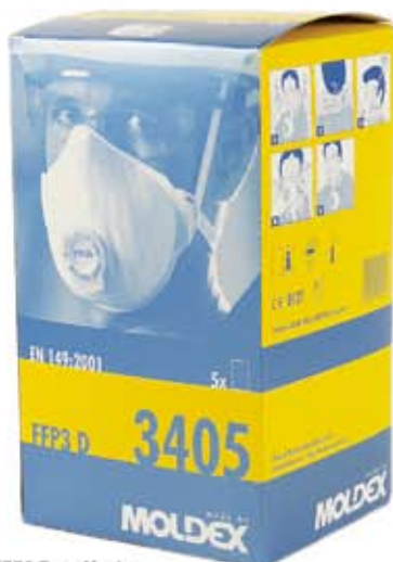
Moldex 3405 FFP3 Face Mask