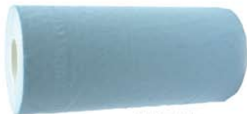
Blue Paper Rolls