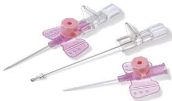
Vasofix Safety Cannulae