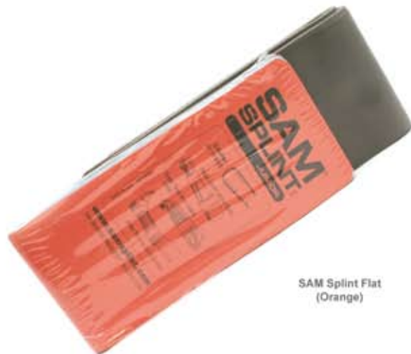
SAM Splint Flat (Orange)