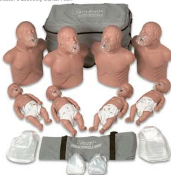
Instructor's Economy Starter Pack

230864 Instructor's Economy Starter Pack