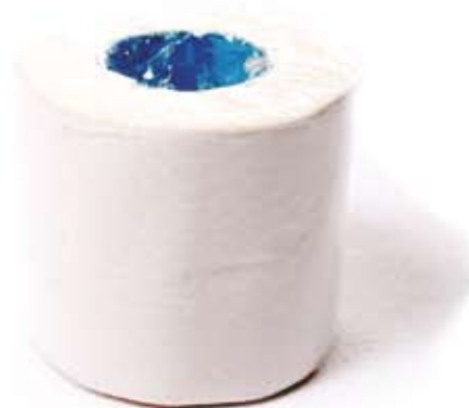
Zinc Oxide Tape