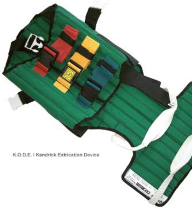
K.O.D.E. I Kendrick Extrication Device