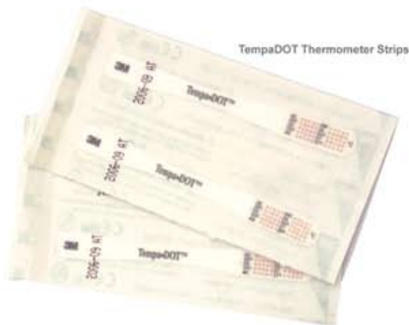
TempaDOT Thermometer Strips