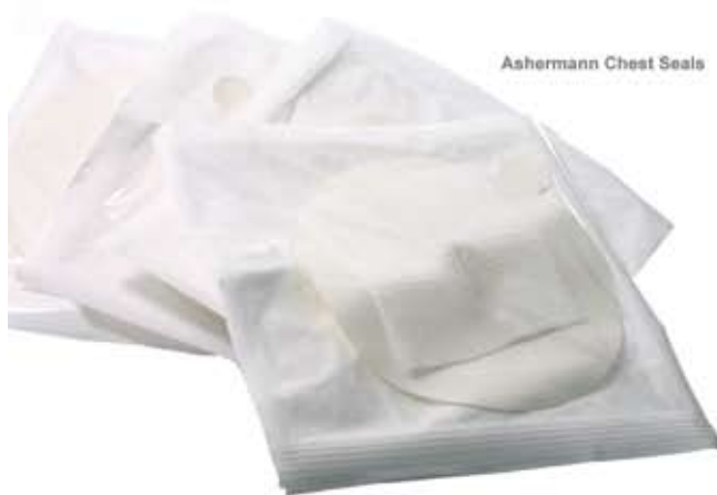
Ashermann Chest Seals