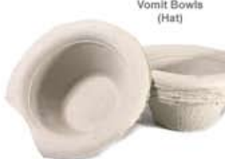
Vomit Bowls (Hat)