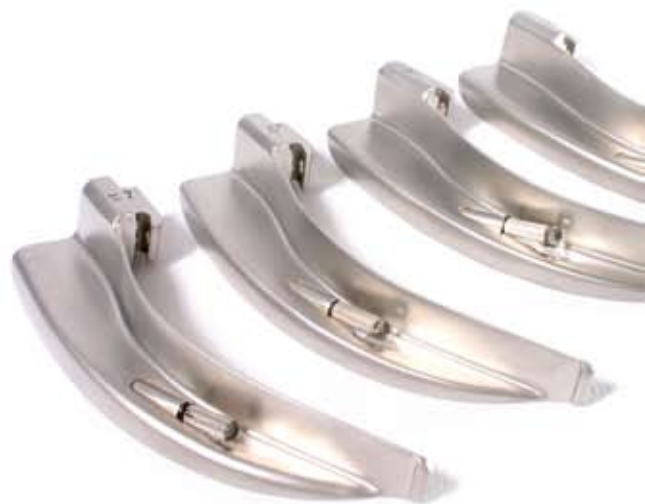
Macintosh Laryngoscope Blades

High grade stainless steel single-use Macintosh style Laryngoscope blades fit both our adult and paediatric handles. Available in a range of sizes.