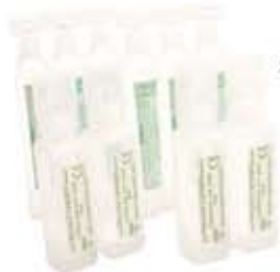
20ml Eye Wash Pods