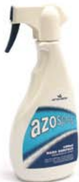
Azospray Alcohol Disinfectant Spray