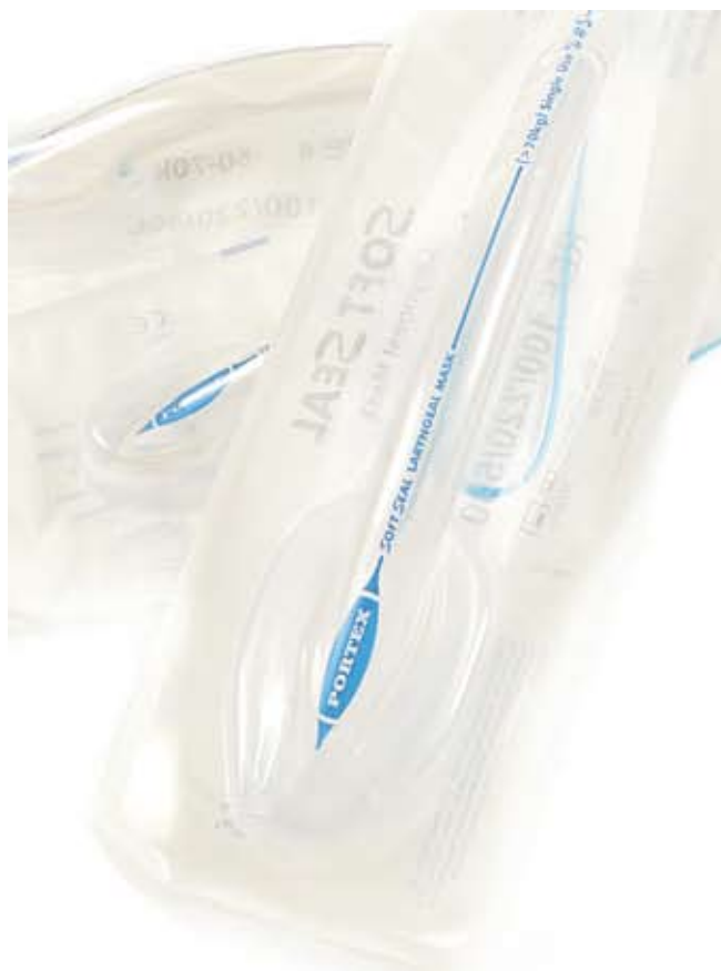
Portex Soft Seal Laryngeal Masks