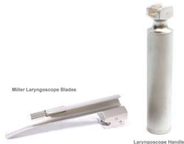
Miller Laryngoscope Blades

High grade stainless steel single-use Miller style Laryngoscope blades fit both our adult and paediatric handles. Available in a range of sizes.