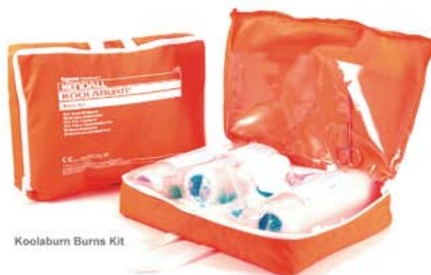
Koolaburn Burns Kit