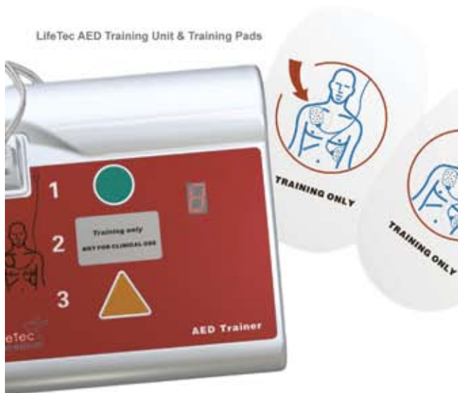
LifeTec AED Training Unit & Training Pads