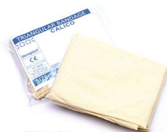
Calico Triangular Bandages

210347 Sterogrip Tubular Bandage - Large thighs (G)