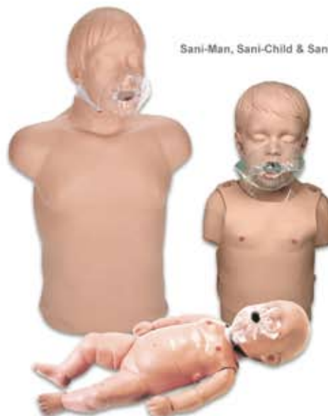
Sani-Man, Sani-Child & Sani-Baby

These economical CPR manikins feature a single-use airway/lung/face shield system, realistic chest rise and anatomical landmarks including the sternum, rib cage and substernal notch. No cleaning, disinfecting or disassembly required!