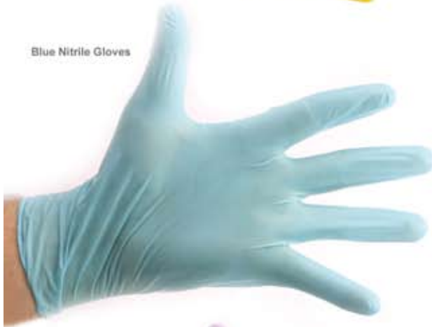
Blue Nitrile Gloves

220108 100 x Sempercare Blue Nitrile Gloves - Extra Large