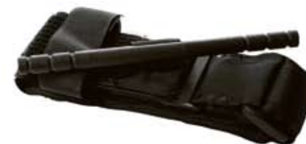
Combat Application Tourniquet