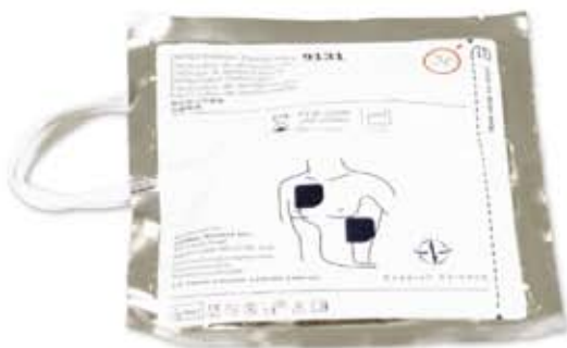
Replacement Defibrillation Pad