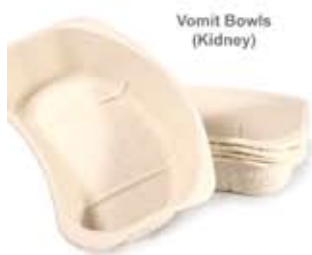
Vomit Bowls (Kidney)