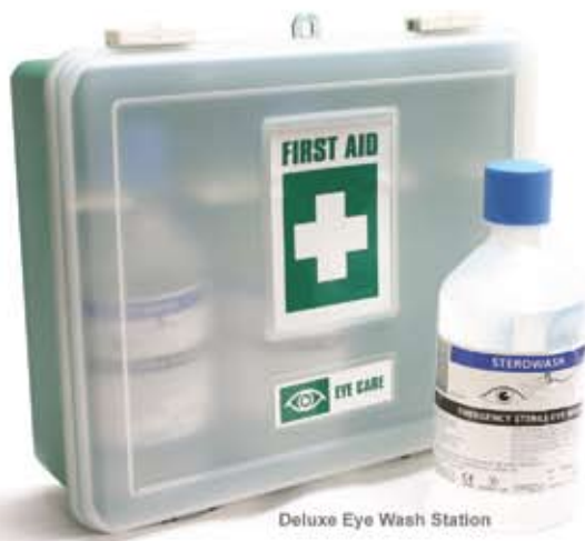
Deluxe Eye Wash Station