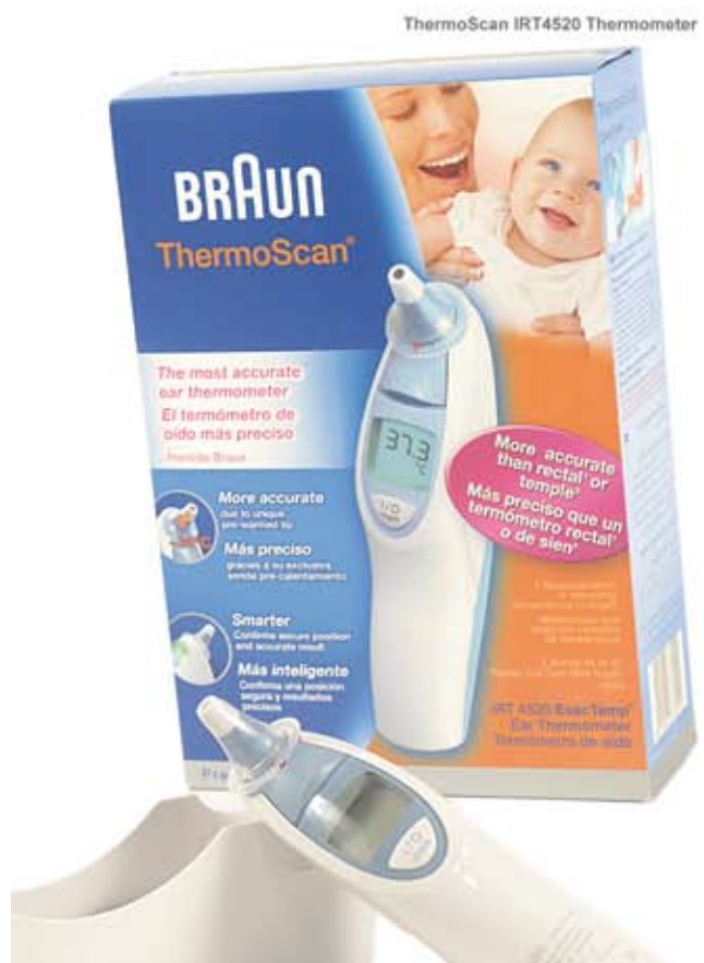
ThermoScan IRT4520 Thermometer

250078 200 x Thermoscan IRT4520 Lens Covers