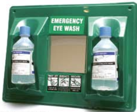
Eye Wash Station with Mirror