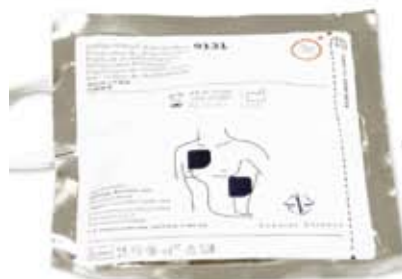
Replacement Defibrillation Pads