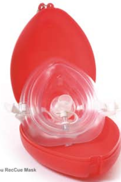
Ambu ResCue Mask