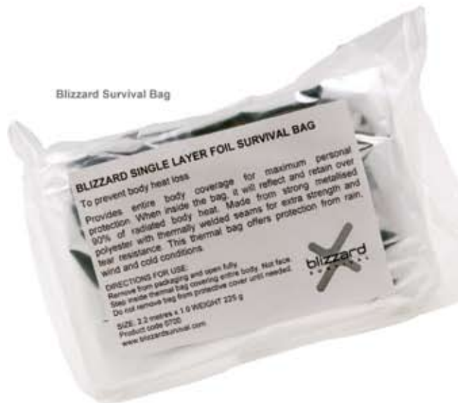
Blizzard Survival Bag

210604 Mediwrap® High Protection Blanket - Paediatric