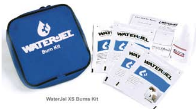
WaterJel XS Burns Kit