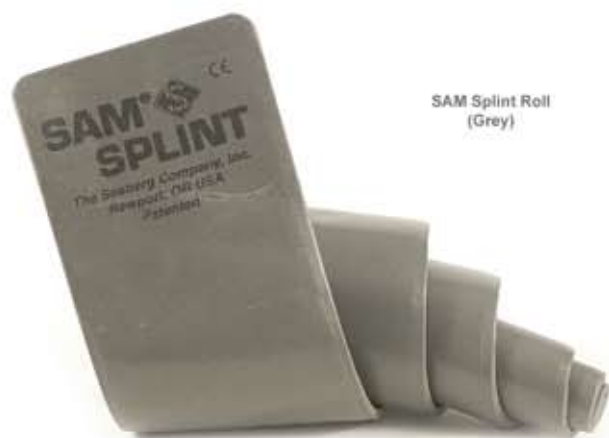
SAM Splint Roll (Grey)