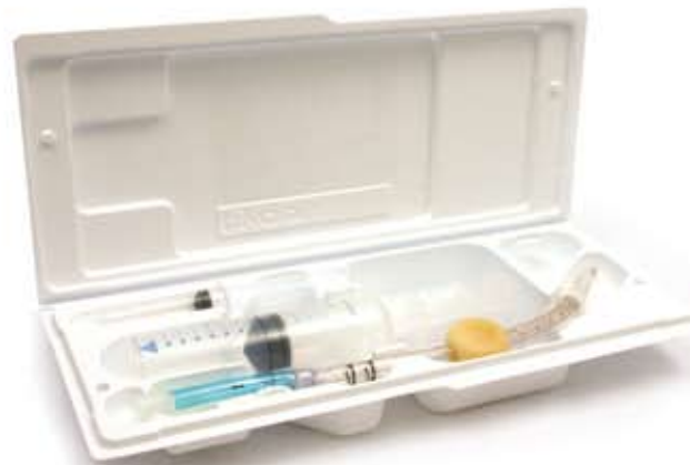
CombiTube (Hard Case)