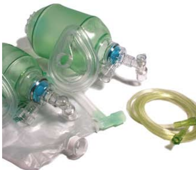
Merlin Vinyl BVMs