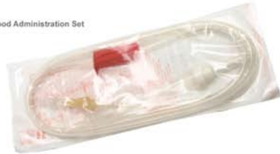
Blood Administration Set