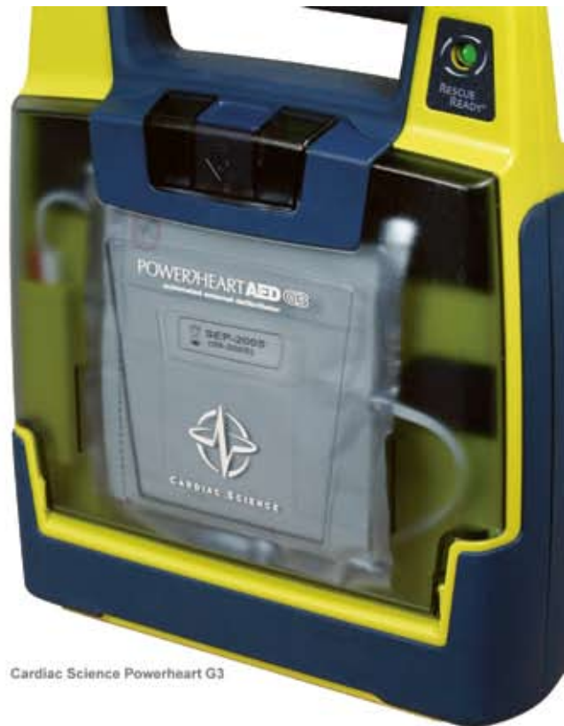
Cardiac Science Powerheart G3