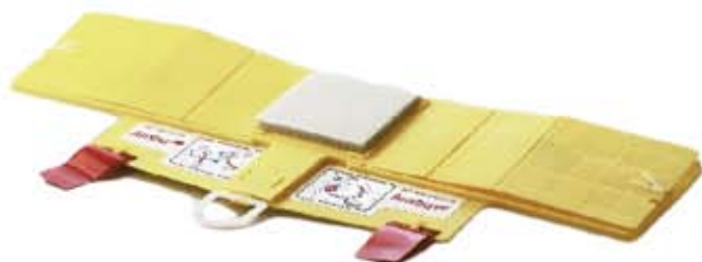
Ambu Disposable Head Wedge