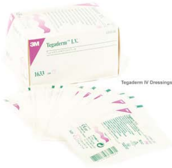
Tegaderm IV Dressings