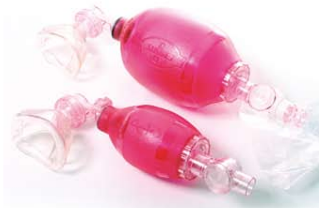
Smart Bag BVMs