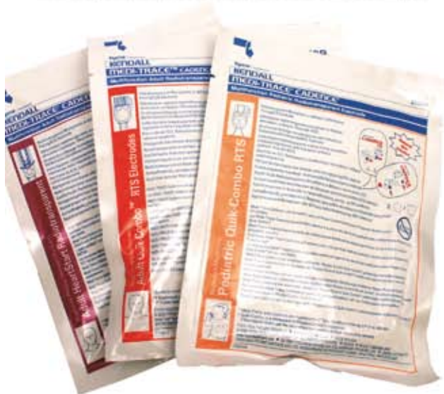
Medi-Trace Defibrillation Pads for Heartstart & Quik-Combo defibrillators