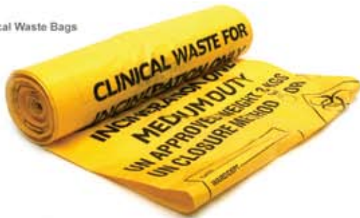
Clinical Waste Bags