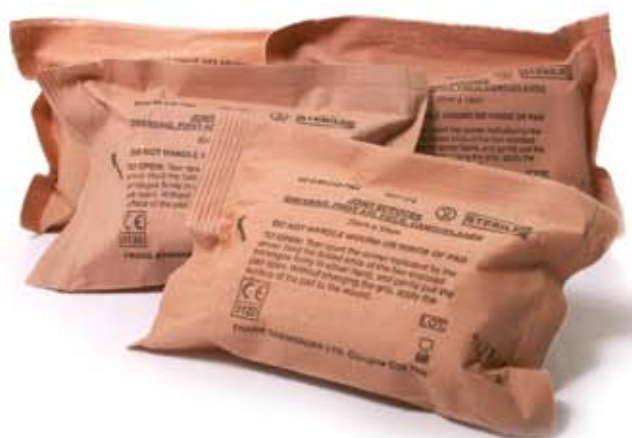
First Field Wound Dressings