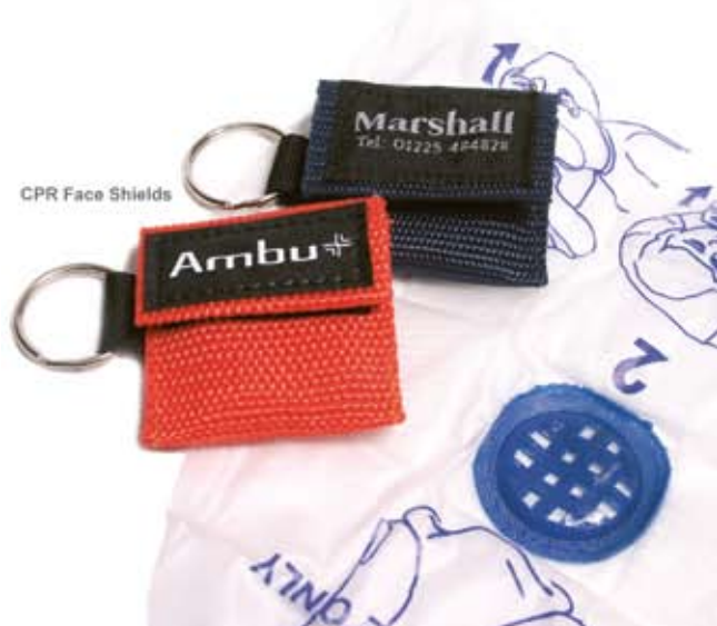
CPR Face Shields