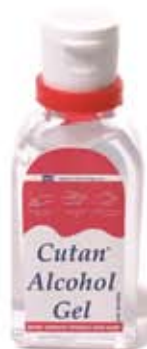
Cutan Hand Sanitiser