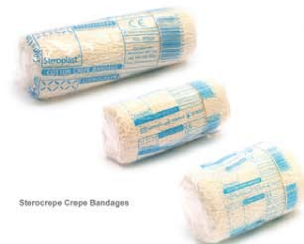
Sterocrepe Crepe Bandages