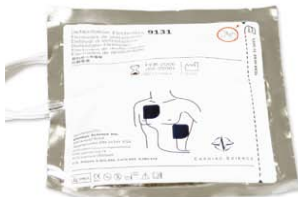
Training Defibrillation Pad