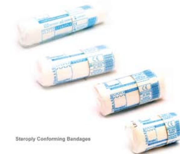
Steroply Conforming Bandages