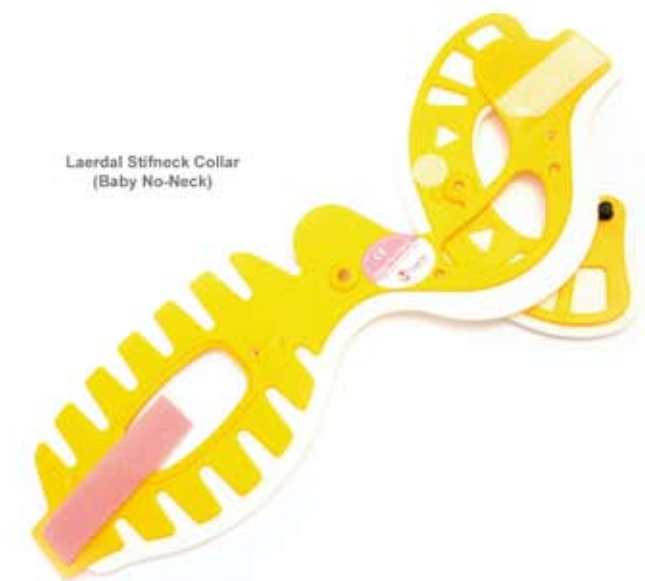
Laerdal Stifneck Collar (Baby No-Neck)