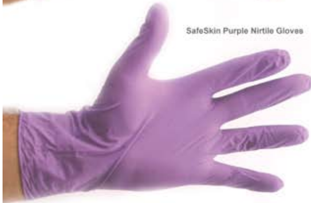
SafeSkin Purple Nitrile Gloves

220104 90 x SafeSkin Purple Nitrile Gloves - Extra Large