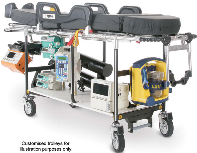
Customised trolleys for illustration purposes only

FN.CCT-XL Ferno CCT-XL Critical Care Trolley