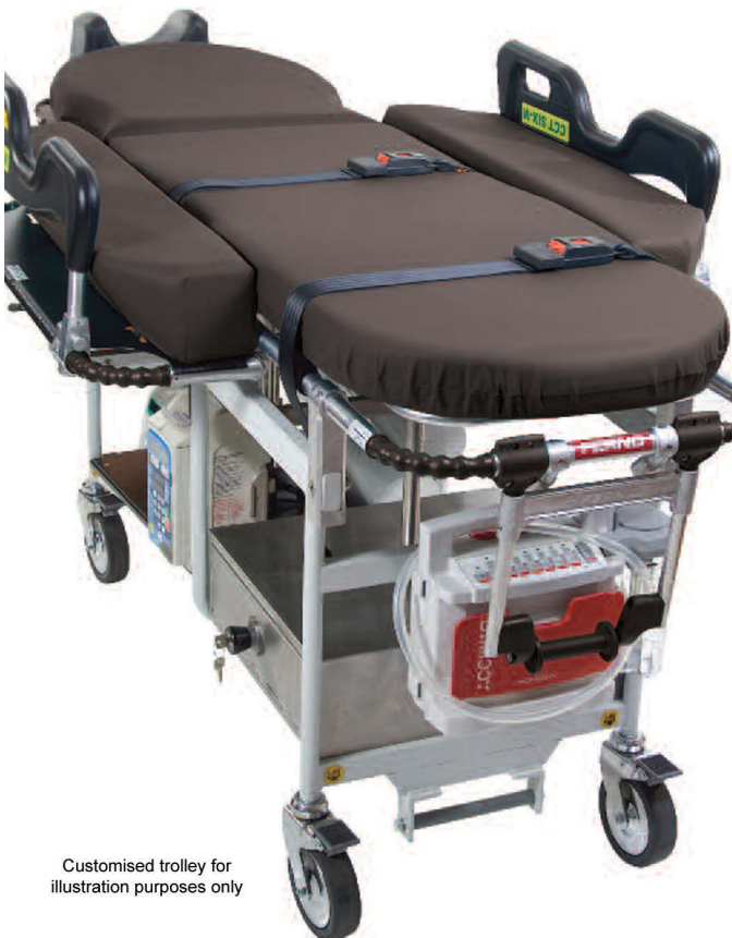
Customised trolley for illustration purposes only

visit us online: www.medicalwarehouse.co.uk