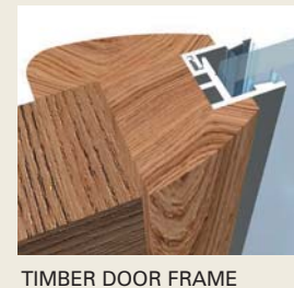
ALUMINIUM DOOR FRAME TIMBE