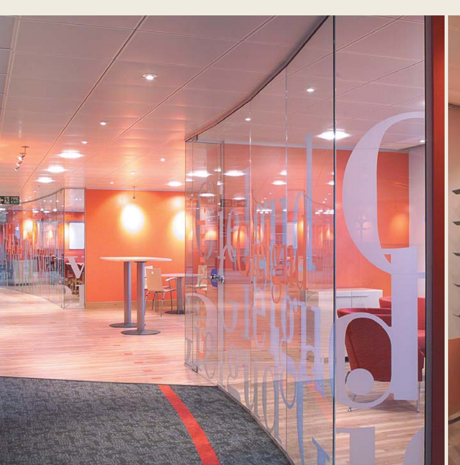
GLASS JOINT DETAIL