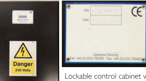
Lockable control cabinet with a CE mark