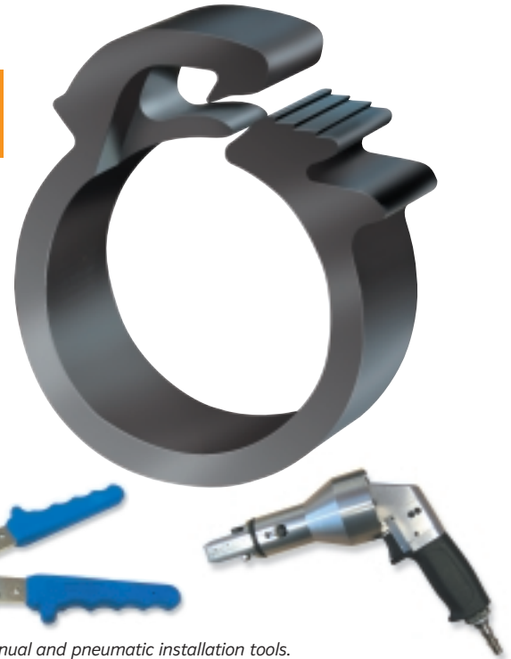
Ezyklik manual and pneumatic installation tools.