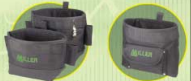
Medium or Large Open Bolt & Bull Pin Bag