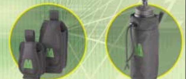
Mini or Regular Mobile Phone/Radio Holders