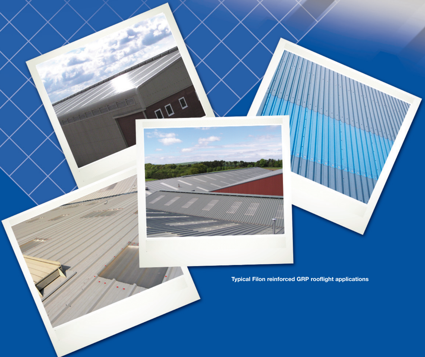
Typical Filon reinforced GRP rooflight applications