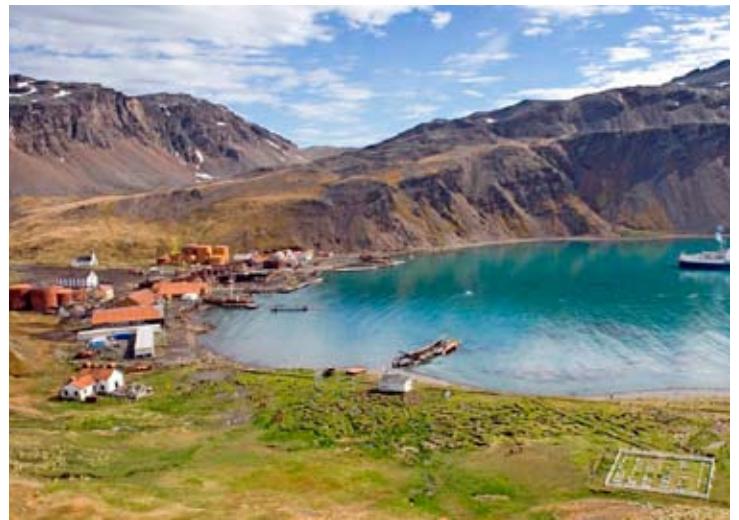
Rockbond Fastrock Super Accelerated Concrete (RB FRSAC) placed by the British Antarctic Survey to repair concrete at the tidal zone, South Georgia, Antarctica, at ambient temperatures of 5°C and below.