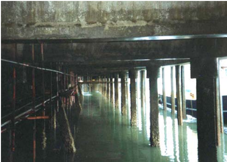
Rockbond Repair Concrete used to repair reinforced concrete columns and beams in the tidal zone at Brixham Harbour, Devon.