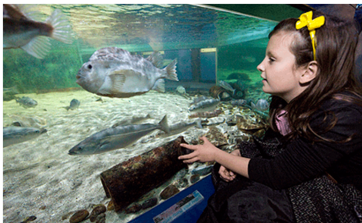
Rockbond Underwater Mortars used to form rock features and artifacts for the Mull of Galloway Marine Aquarium, Aberdeenshire, Scotland