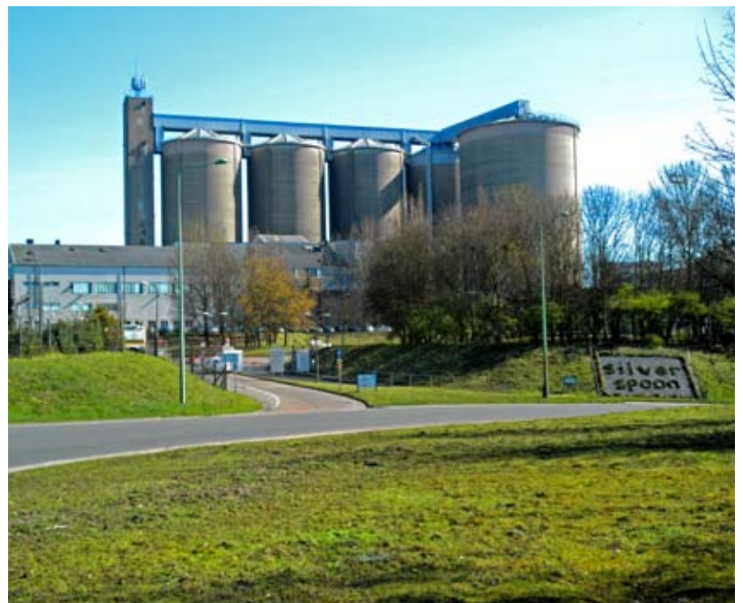
Rockbond Abrasion Resistant Mortar and Floor Screed Steel Reinforced used for flume and flatbed repairs at British Sugar.