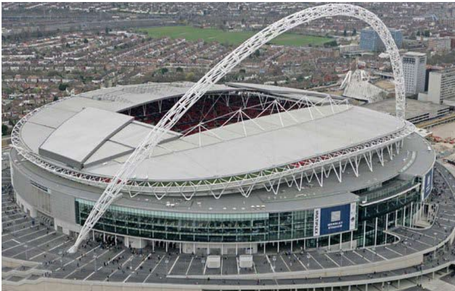
Rockbond products used at the Olympic Park, Stratford.