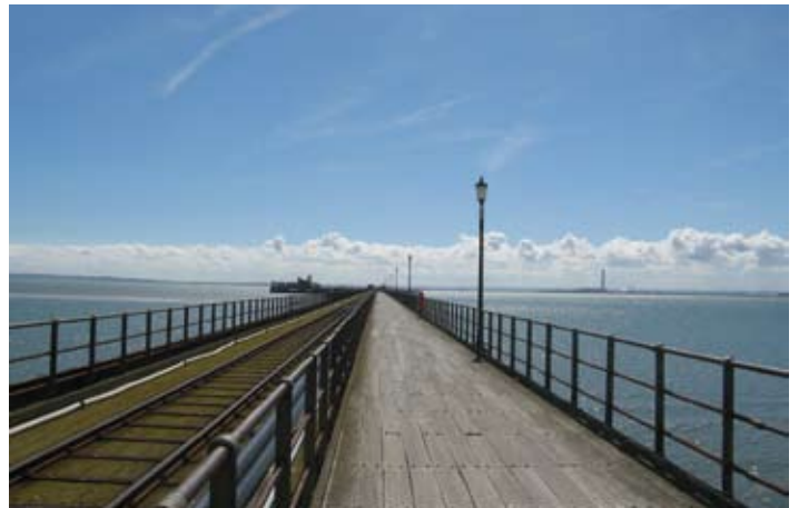
Rockbond Underwater Admixture 2401 used to accelerate the concrete for the repair to steel piles at Southend Pier.