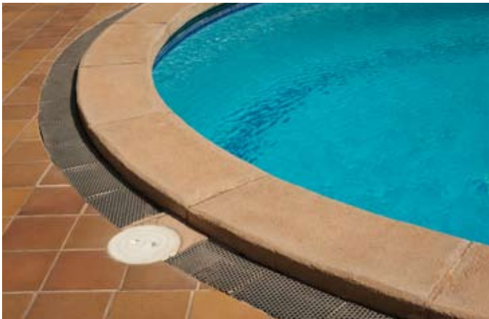
Rockbond Underwater Putty TGW used as tile adhesive, and as a repair and pointing material for use in underwater applications in swimming pools without draining the water from the pool.