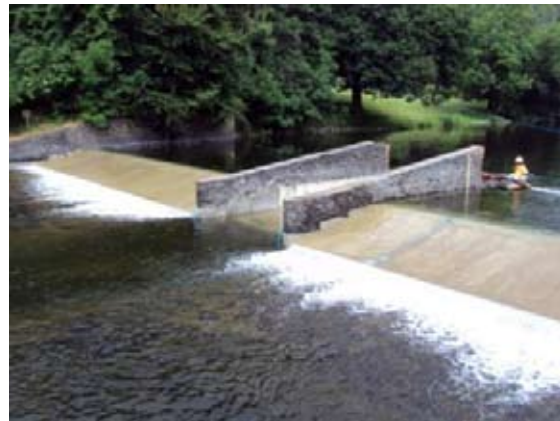
Rockbond Underwater Mortar used to repair the bridge and weir at Newby, Ulverston