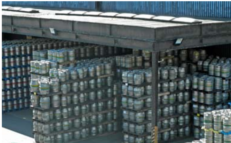
Rockbond Floor Screed Steel Reinforced to repair the floor and loading bay areas at the Green King brewery, Bury St. Edmunds, Suffolk.