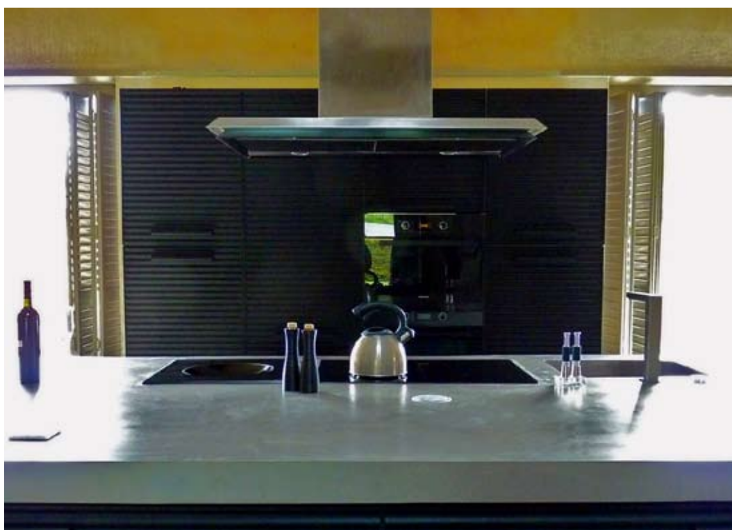
Rockbond WorkTop Concrete for casting concrete countertops, worktops and furniture for home and garden.