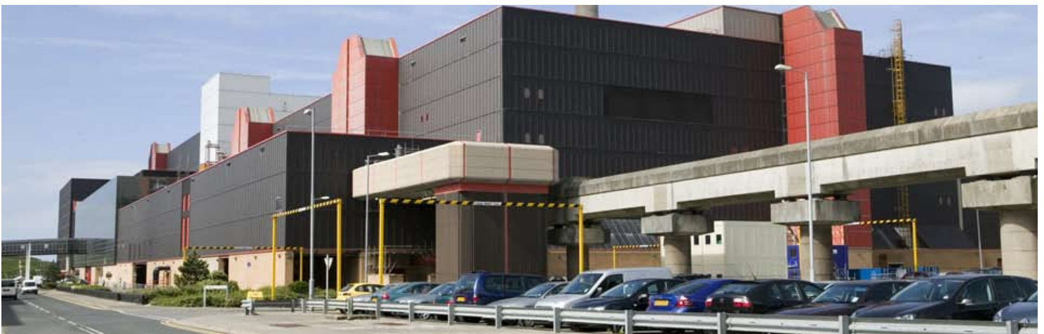
Rockbond Super Density 3600 Grout used for radiation shielding in nuclear storage vessels at Sizewell power station, Suffolk.