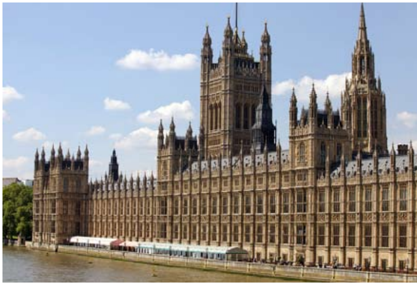
Rockbond Waterstop Mortar and Rockbond Flexible Membrane to seal and waterproof the walls of the restaurant below the level of the river Thames at the House of Lords, The Palace of Westminster.