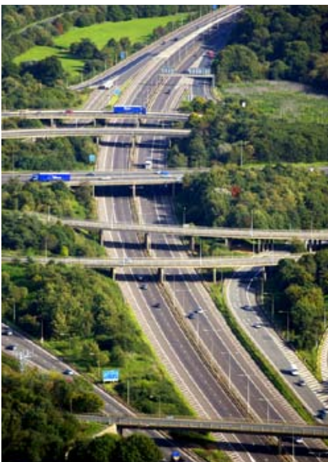
Rockbond Fastrock Concrete used to repair carriageway concrete on the M25.