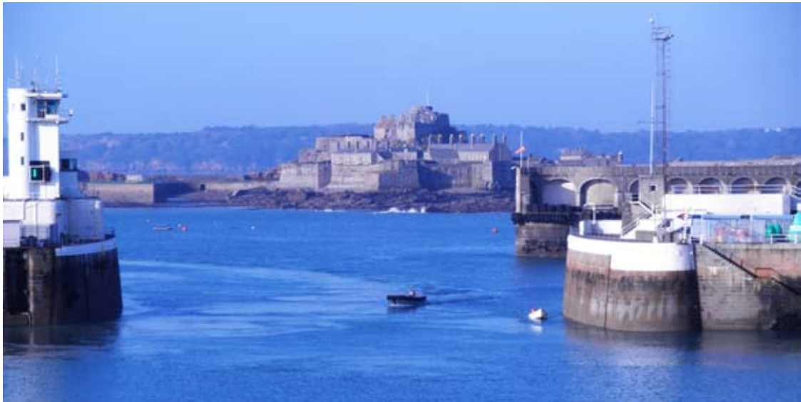
Rockbond Underwater Mortar use to protect concrete piers against scour attack at the Queen Elizabeth Ferry at Jersey Port, Channel Islands.