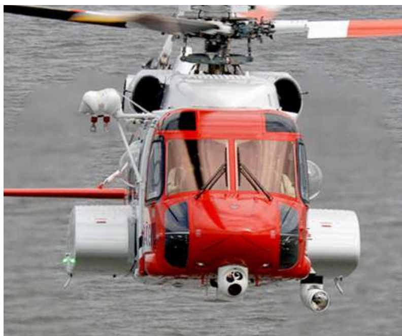
Figure 1 - Tandem Encoders are ideally suited to camera gimbals

Tandem encoders are increasingly being used in those applications with one or more of the following factors – cost pressure, tight space constraints, weight limits or requirements for high-reliability. For most position encoders the single largest cost element is their electronics and the Tandem approach effectively spreads the cost of a single set of electronics across two (or more) encoders. The result is that the cost, weight and volume per sensor is reduced. Another important factor is the use of slip rings in the host equipment. If slip rings are being used to energize the encoders it is often the case that a tandem encoder is applicable. This is because the cost, size and complexity of a slip ring is directly proportional to the number of its contacts. Eradicating slip ring connections to a second encoder can be a major advantage for the tandem encoder approach.