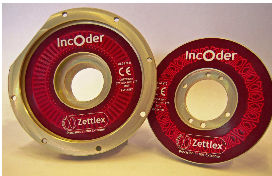
Figure 3 – An example Tandem Encoder from a long range electro-optical system.

Traditionally such inductive detectors have used transformer constructions in the form of accurately wound wire spools. The basic principle is that as a passive, magnetically permeable element such as a rotor or a rod moves, it changes the electromagnetic coupling between at least one primary winding and one or more secondary windings. The energy which inductively couples in to the secondary windings is directly proportional to the displacement of the rod or rotor relative to the primary windings. All windings must be wound accurately to achieve accurate position measurement and in order to achieve strong electrical signals, lots of wires are needed. This makes traditional inductive position sensors bulky, heavy and expensive.