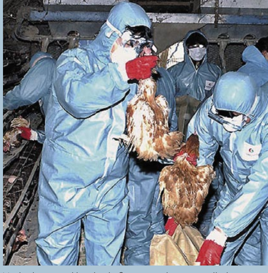
Viral diseases like bird flu must be controlled. An infrared camera can help to detect possible patients in an early stage.

Legal disclaimer: although infrared cameras are accurate temperature measurement devices, they have not been tested or qualified as diagnostics medical equipment. As such FLIR Systems cannot be hold liable for any error resulting from the use of these systems or errors in the interpretation of the results. The methodology as described has not been validated by clinical tests and should be used as a guideline only.