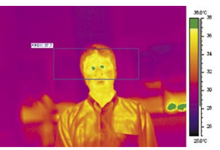
The infrared image clearly shows the hot spots in the corner of the eyes.

subject requires further examination: all areas, which are hotter than a predefined temperature value, can be immediately recognized on the infrared image.