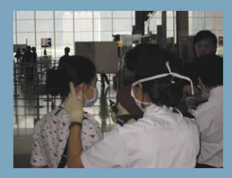
The average temperature of a healthy person can be determined with an ear thermometer or with the Automatic Temperature Compensator (ATC) in the FLIR ThermaCAM.