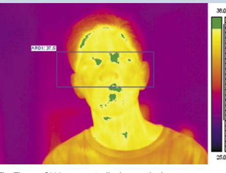
The ThermaCAM automatically detects the hottest temperature within an area, set by the operator. A color alarm makes it easy to decide whether a person needs further examination or not.