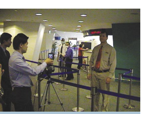
Setting up a ThermaCAM with Automatic Temperature Compensator (ATC) for viral disease detection.

A built-in colour alarm function enables an immediate decision whether the