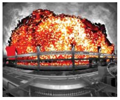
Cokes production: hot areas that have not been cooled down can be identified immediately with the PYROsmart system. In combination with a fire monitor, the parts that are too hot can be cooled immediately.

"The PYROsmart is also seeing to it that no more water is sprayed than absolutely necessary and only on places where it is necessary. This contrary to what happens normally: put a man with a water hose next to the cokes to cool them down."