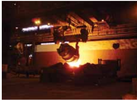
The refractory on this ladle shows signs of wear and if it degenerates further needs to be replaced. Thermal imaging cameras are the only practical tool available for refractory inspections.

The fact that thermal imaging technology is visible and intuitive also makes it very easy to learn for new employees. That can also be quite deceptive, however, according to Willems. "The thermal imaging cameras from FLIR are so easy to use that you might think that it is just a matter of pointing the camera and pressing the right button. It is very important, however that you know what you're doing. You need to know how to accurately correct for emissivity and reflection, for instance. Otherwise you might draw false conclusions."