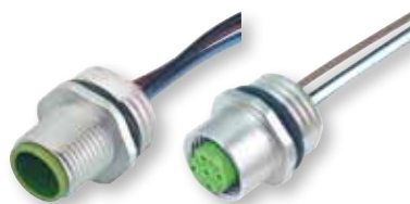
M12 Flange Connectors