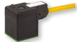
MSUD valve plug connector