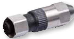
V2A M12 Mosa with IDC technology