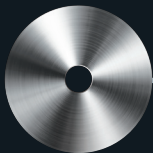
Deep Hole Drilling