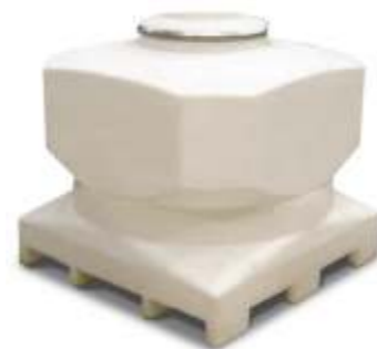
H Series IBC