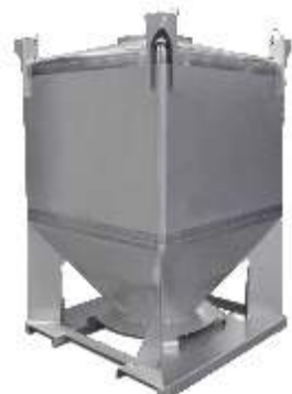
S Series IBC