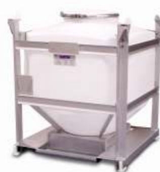
R Series IBC