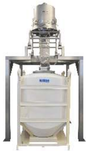
Sack Tip & Sieve