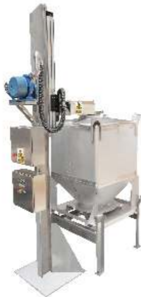
IBC Wash Station